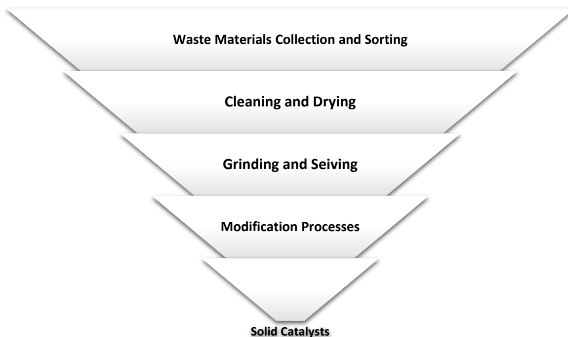
Figure 2. Generic synthesis method for transforming agricultural wastes into a solid catalysts.