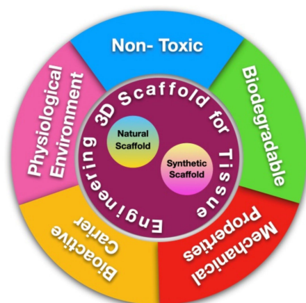
Figure 1. Scaffold for Tissue Engineering.

To confirm the success of the cell growth and differentiation processes in tissue engineering, scaffold materials must be able to interact with host tissues and provide an ideal environment for tissue growth [29,46]. The ideal scaffold for pulp regeneration should fulfill three criteria: biocompatibility, adequate rigidity to withstand mastication force, and tight sealing with dentin to prevent micro-organism infiltration [29,44]. Other than that, the degradation process of a scaffold is usually one of the factors that plays a role in treatment failure [47]. The rate of scaffold degradation should be complementary to the rate of new tissue formation and should not produce harmful waste side products [15,48,49]. Utilization of the use of scaffolds in tissue engineering technology must fulfill several characteristics which can be seen in Figure 1.