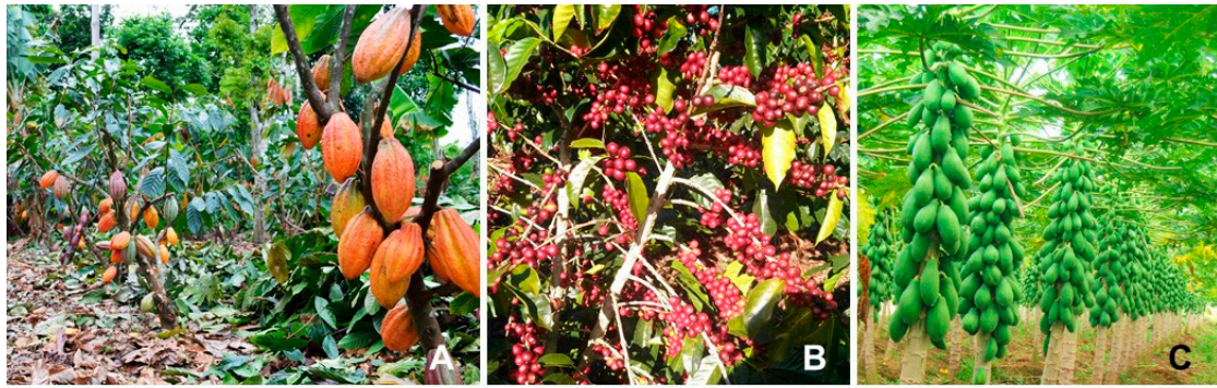
Figure 1. Tropical crops that may be amenable to genome editing and chromosome engineering, as actually grown in Costa Rica. (A) Cacao field plot of newly developed, self-compatible variety CATIE-R1 at CATIE, the Tropical Agricultural Research and Higher Education Center (Cartago province, Costa Rica). (B) Arabica coffee plants, Catuai Yellow cultivar (León Cortés county, Costa Rica). (C) Papaya, Pococi hybrid (Alajuela province, Costa Rica).