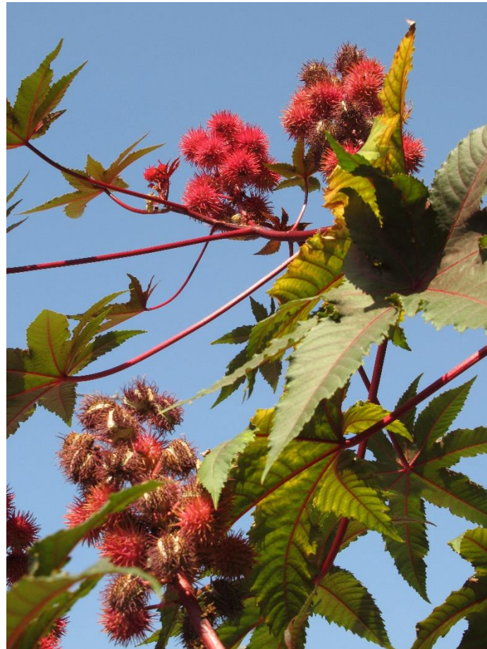
Figure 1. Ricinus communis L. (CB).

by the environment. Racemes can have different shapes (conical, cylindrical, or oval) with different capsule arrangements, which can be compact, semi-compact, or loose [25]. According to the order of manifestation, the racemes are called primary, secondary, or tertiary, and their numbers increase geometrically with the number of branches [27]. The castor bean stem is round, sometimes covered with a waxy bloom, and it may be green, reddish, or purple [25]. The dark-purple stem and the sulfur-yellow colors are occasional [24].