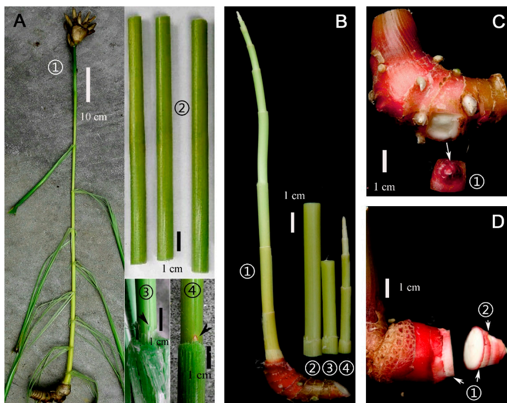
Figure 1. Four types of explants were prepared from stem or rhizomes of Hedychium coronarium ‘Hanyue’. (A-1) Mature stem at anthesis; (A-2) after stripping out-layer leaves, the stem was cut to 3–4 cm in length and were sprayed thoroughly with 75% ethanol ( v/v ) once in a laminar air flow hood; (A-3) the most inner layer was stripped; and (A-4) single node explant with a bud or eye (arrow) was obtained. (B-1) Young stems prior to anthesis; the stem was cut to small segments and sprayed thoroughly with 75% ethanol once in a laminar air flow hood. The most inner layer was stripped, and single node explants were harvested (B-2 and B-3), but the tip of stem (B-4) was not used as buds were either invisible or underdeveloped. C. Mature rhizome was washed and sprayed with 75% ethanol once. Single eye explant was produced by cutting single eye out of the disinfected mature rhizome (C-1). D. Rhizomes with new growth (D-1) were cleaned and sprayed with 75% ethanol once. Young and fresh portion of rhizome was cut from the mature portion (D-2) and used as young rhizome tip explants.