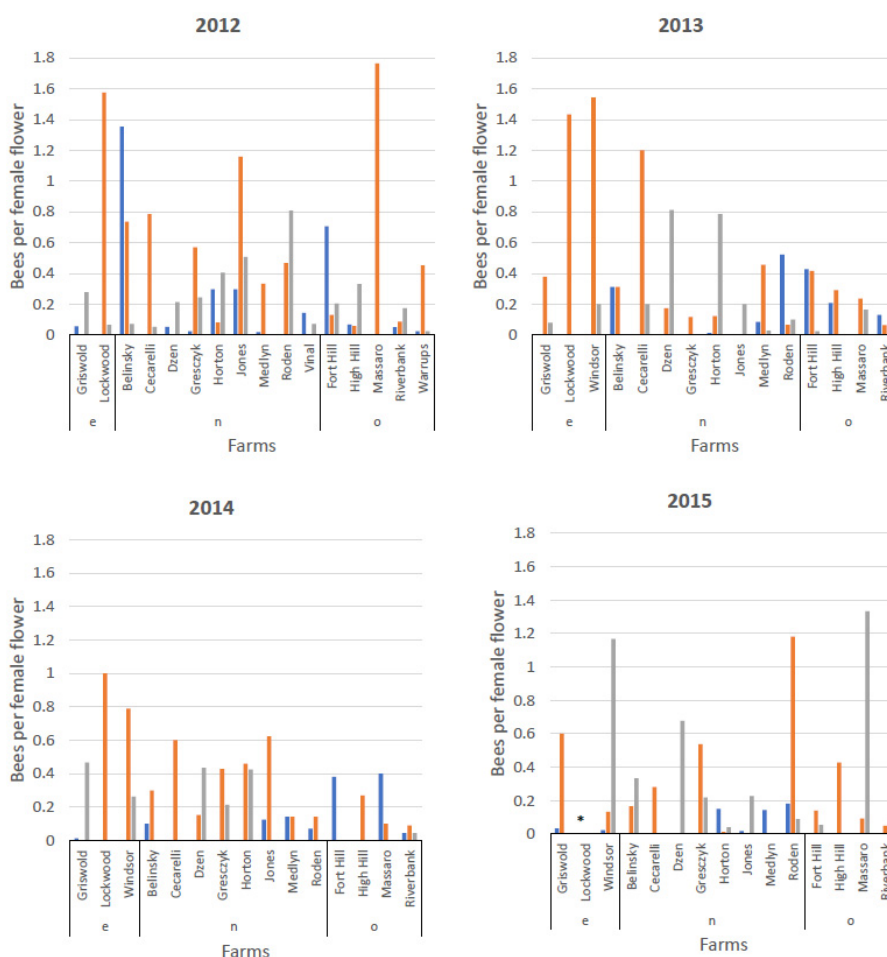
Figure 3. Bees by species per female flower in hourly 100 flower bee counts by farm and by year. Blue = squash bees, orange = bumble bees, and gray = honey bees; e = experimental farms, n = non-organic farms, and o = organic farms. * Lockwood in 2015 did not have any female flowers among the samples counted.

The overall trends shown in Table 4 were superimposed on tremendous variation in species composition and overall numbers of bee visitation to female flowers among farms each year and among years on many of the farms, as shown in Figure 3. For example, at Massaro Farm, bumble bee visitation dominated in 2012, followed by a year with approximately equal and much lower visitation by both bumble bees and honey bees in 2013, then primarily squash bees in 2014, and finally primarily honey bees in 2015.