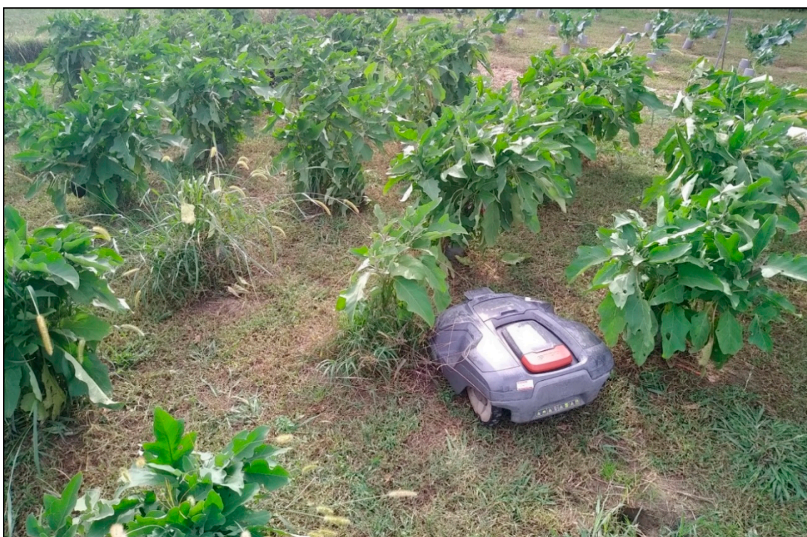
Figure 6. Autonomous mower managing living mulch in aubergine test field at the University of Pisa.