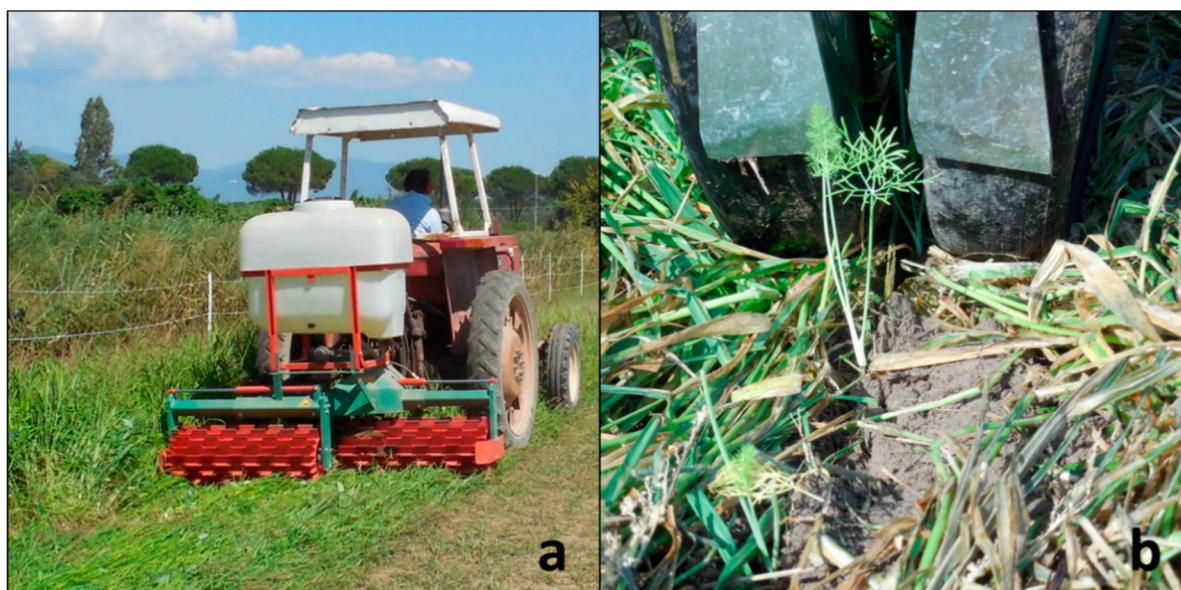
Figure 5. Clemens ballasted crimper roll (Clemens technologies, Wittlich, Germany) used to terminate a cover constituted by a mixture of rye and vetch at Pisa University at work (a) and detail of a well transplanted plant of fennel on the rolled cover with the transplanter developed at the University of Pisa (b).

in arable fields is strongly affected by agronomic practices such as tillage and fertilization management and some weed species are promoted by NT or RT. A seven-year study carried out in South Italy on a long-term durum wheat–faba bean rotation showed clear evidences that the effect of tillage on the overall weed community was more evident than that of nitrogen supply [71]. Combining NT techniques and cover crops either as living or dead mulch, Antichi et al. [72] tested the performance of an innovative organic and conservation vegetable system. The trial consisted of a three-year field experiment on savoy cabbage ( Brassica oleracea var. sabauda L. cv. Famosa F1, Bejo), spring lettuce ( Lactuca sativa L. cv. Justine, Clause), fennel ( Foeniculum vulgare Mill. Cv. Montebianco F1, Olter), and summer lettuce ( L. sativa L. cv. Ballerina RZ, Rijk Zwaan) crop rotation. The termination of cover crops (CC) as well as the management of crop residues and living mulch was implemented by rolling with a roller crimper alternated with flaming (Figure 5) [73].