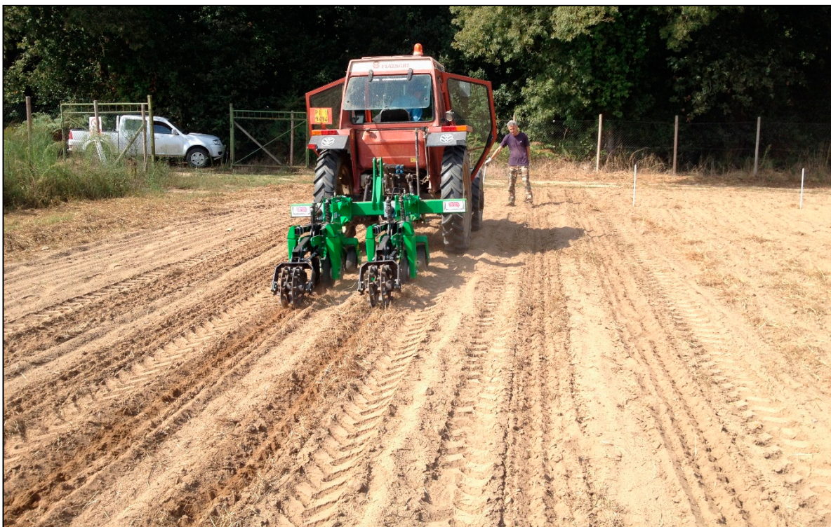
Figure 3. Prototype of a strip tiller realized by CMA Machine Agricole srl tested at the University of Pisa.

planter Kinze 3100 at row distance of 0.71 m; (iii) strip tillage plus precision line planting carried out by a strip tiller Khun Striger at inter axle spacing of 0.71 m plus the Kinze 3100 and precision sod planter Kinze 3100. The research starts from the observation that a solution for developing a hybrid machine to strip-till and sow all crops, without affect crop performances, could be realised by regulating row spacing together with moving from line to banded seed placement. The results showed that a silage maize crop can achieve good crop performances when cultivated by strip tillage practices associated with volumetric band seeding. Moreover, the authors stated that similar results could be provided for high-density crops like winter cereals by realizing environmental and economic benefits due to a reduction of the machinery pool and an optimization of operational crop management [57].