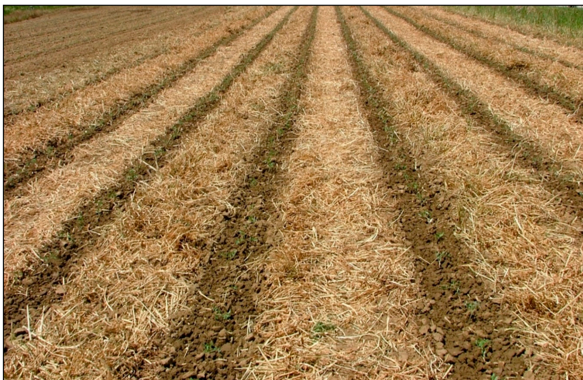
Figure 4. Effect of strip tillage on soil covered by dead mulch and tomato seedlings direct transplanted.