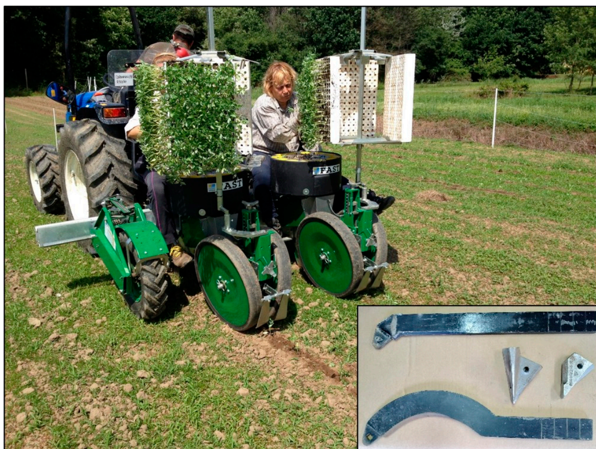
Figure 2. Two-row no-till transplanter realized at the University of Pisa and details of the two shanks opener and points used.