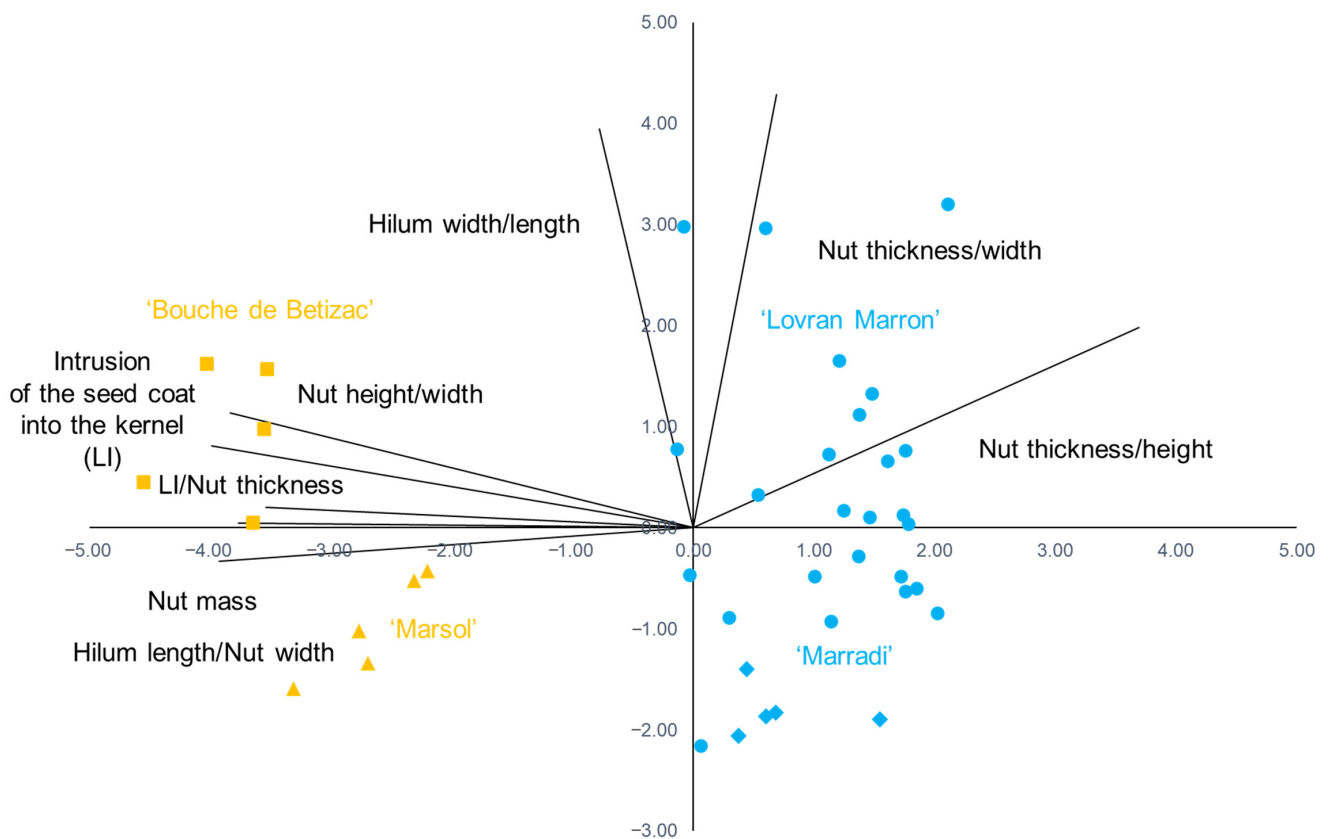
Figure 2. Biplot of the principal component analysis based on eight morphological traits in studied traditional and hybrid chestnut varieties.

The results of the principal component analysis (Table 5, Figure 3), which included the proximate composition and macro- and micro-nutrients, show cumulative variability of 68.3% in the first three PC axes. The first principal component, which accounts for 40.6% of variability, separates the samples with high moisture, ash, crude protein, Cu, Fe, Mg, K and Na content, which are highly negatively correlated with it, from the samples with high crude fat and total carbohydrate content, which is highly positively correlated with the same principal component. The second and third PC axes contribute substantially less to the overall variability, with 17.8 and 10.3%, respectively. The components highly correlated with the second PC axis are Mn (negatively) and Na (positively). The third PC axis is highly positively correlated with Mn and Ca.