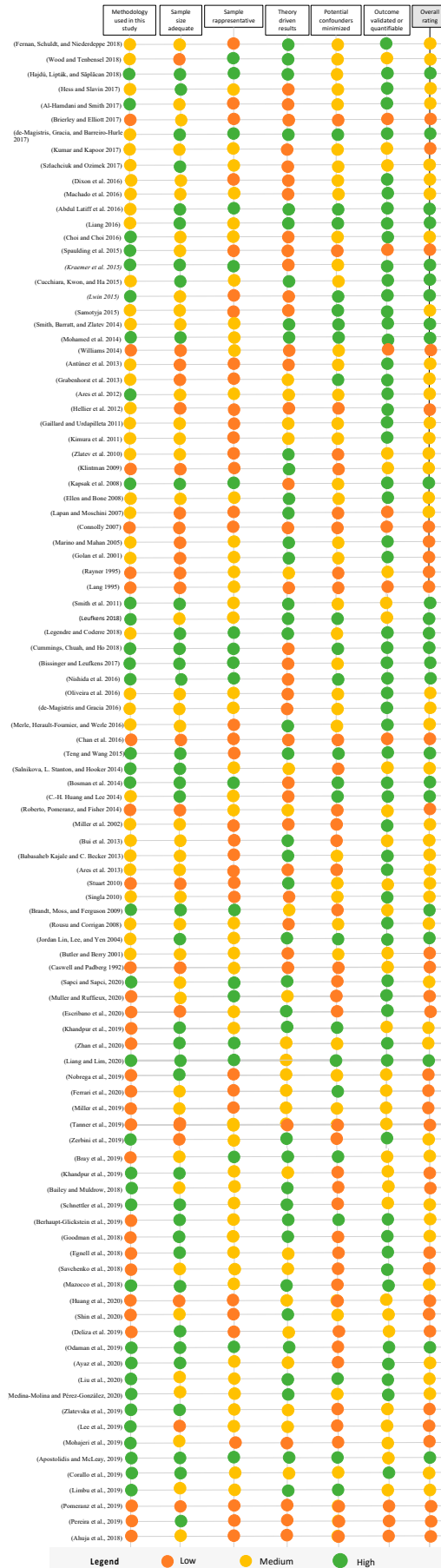
Figure 2. Quality assessment of sample.