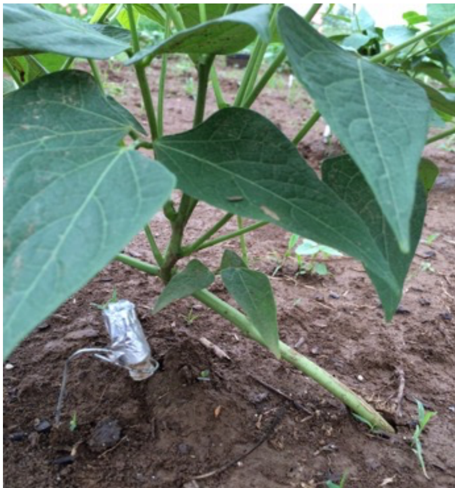
Supplemental Figure 2. Volatile administration setup. Each 2mL glass vial was inverted and supported by wire stands to prevent rain water accumulation. Additionally, each vial was wrapped in aluminum foil to prevent photodegradation.