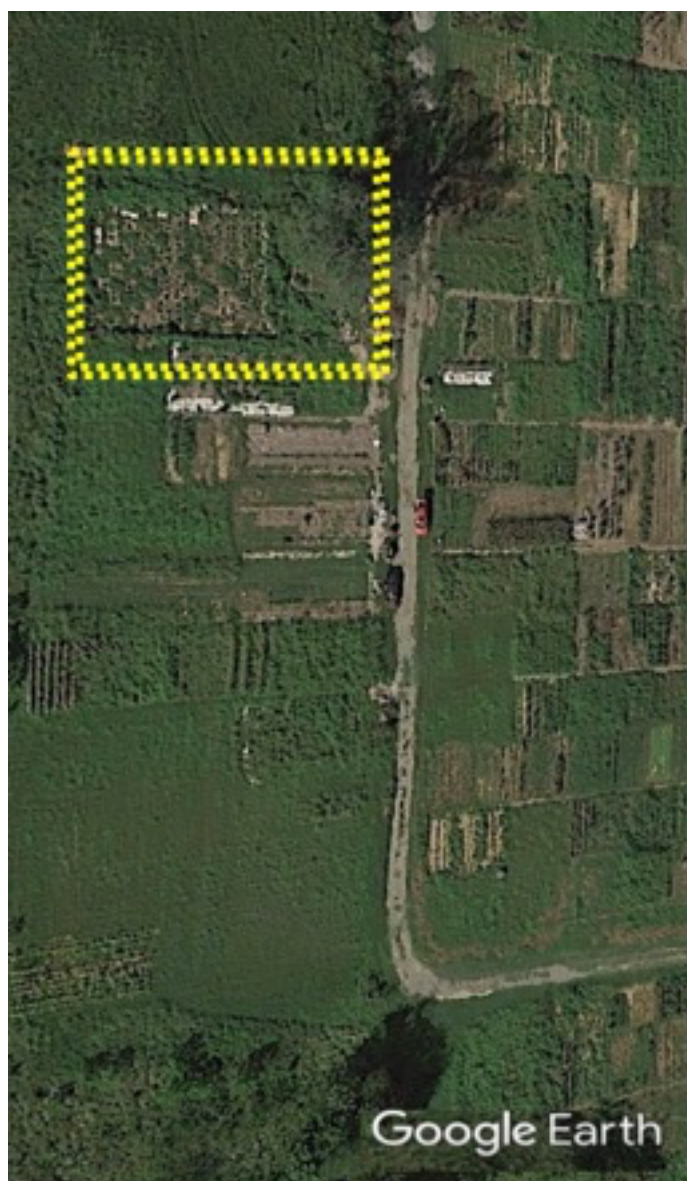
Supplemental Figure 1. Aerial view of the field site within the Blackacre Community Garden. The research area is outlined and the original picture was acquired from Google Earth.