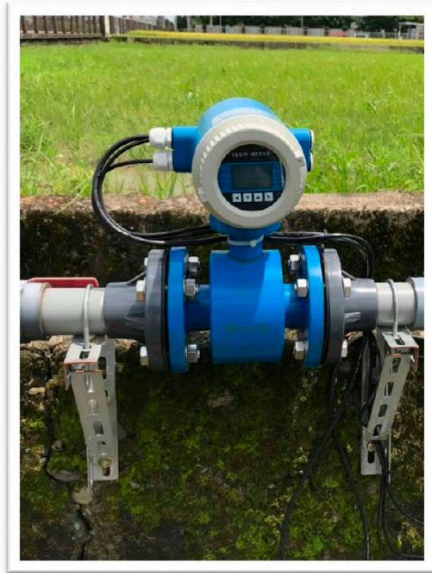
Additional file 1: Figure S1. Intelligent sensor for paddy field. (a) water level sensor (b) remote intelligent water meter.