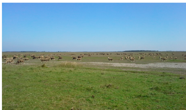
Figure 2. Early autumn view of the salt-affected landscape with grazing sheep at “Apajpuszta” near Apaj village, Hungary.

Within the study region, four characteristic habitat types were chosen as study sites for detailed soil, vegetation and soil microbiome investigations: (1) annual open salt sward— Lepidio crassifolii-Camphorosmetum annuae (CAM), (2) Pannonic Puccinellia limosa hollow— Lepidio crassifolii-Puccinellietum limosae (PUC), (3) Artemisia saline puszta—