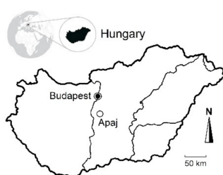
Figure 1. Geographic position of Apaj on the map of Hungary.

A plain called “Apajpuszta” (N 47°05′12.5”, E 19°05′54.1”, 94 m a.s.l.), south of the village Apaj in the Danube-Tisza Interfluve (Hungary), was selected as the study region (Figure 1). The area is known for the variety of salt-affected soils and corresponding halophytic vegetation moderately grazed by sheep in the last few decades (Figure 2).