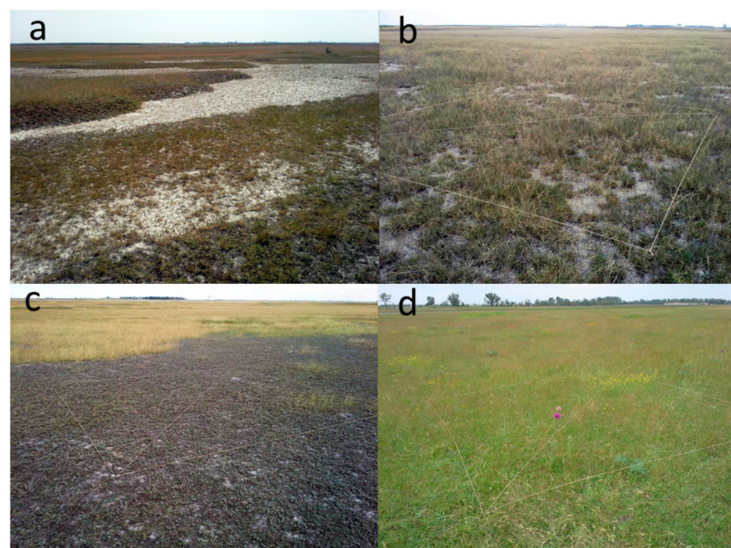
Figure 3. Salt-affected communities at Apajpuszta: (a) Lepidio crassifolii-Camphorosmetum annuae (CAM) in the depressions, (b) Lepidio crassifolii-Puccinellietum limosae (PUC), (c) Artemisia santonici-Festucetum pseudovinae (ART) with “Puccinellietum” in the background, (d) Achilleo setaceae-Festucetum pseudovinae .

In our previous reports, each of the four raw datasets (concerning soil, microbial and vegetation data) was analyzed separately by principal component analysis, and in all cases, replicates from the four study sites formed well-separated (non-overlapping) groups [34]. Therefore, raw data of the 4, 3 and 5 replicates for soil, microbial and vegetation samples respectively, from a given study site (i.e., habitat type), were substituted by their average values, and the averaged datasets were used in a subsequent two-step test. In the first step, the differences among the four different salt-affected habitat types were analyzed by standardized principal component analysis (PCA) based on four distinct descriptor datasets: soil variables, microbial communities in June, microbial communities in September and vegetation data, thus resulting in four different ordination scattergrams. In the second step, the four different ordination scattergrams were compared by Procrustes