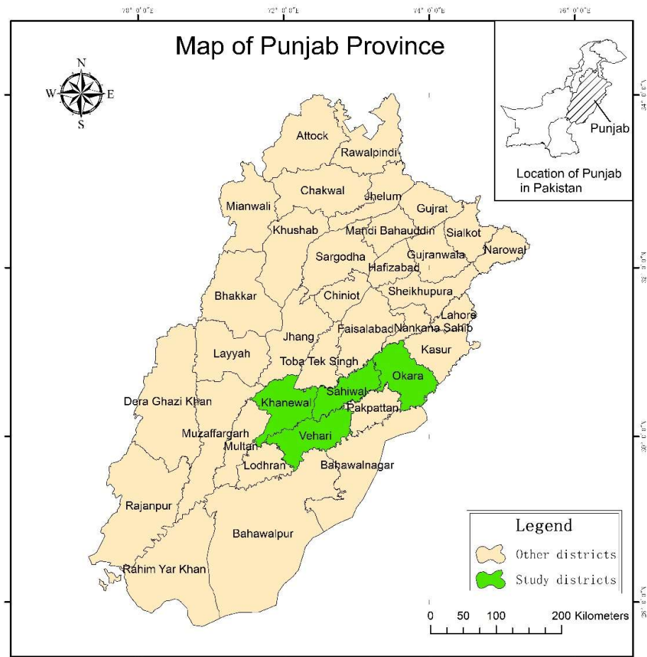
Figure 2. Map of the study area.