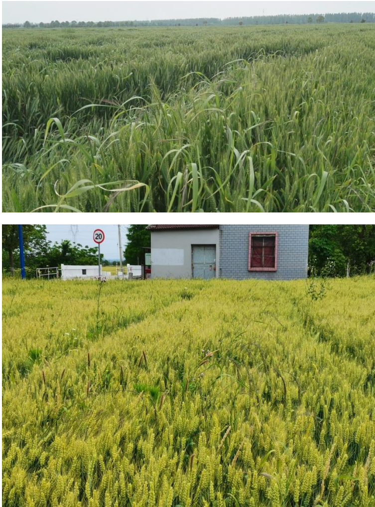
Figure S1. R. kamoji infested wheat fields: Jingzhou, 2017 (upper); Haiyan, 2022 (lower).