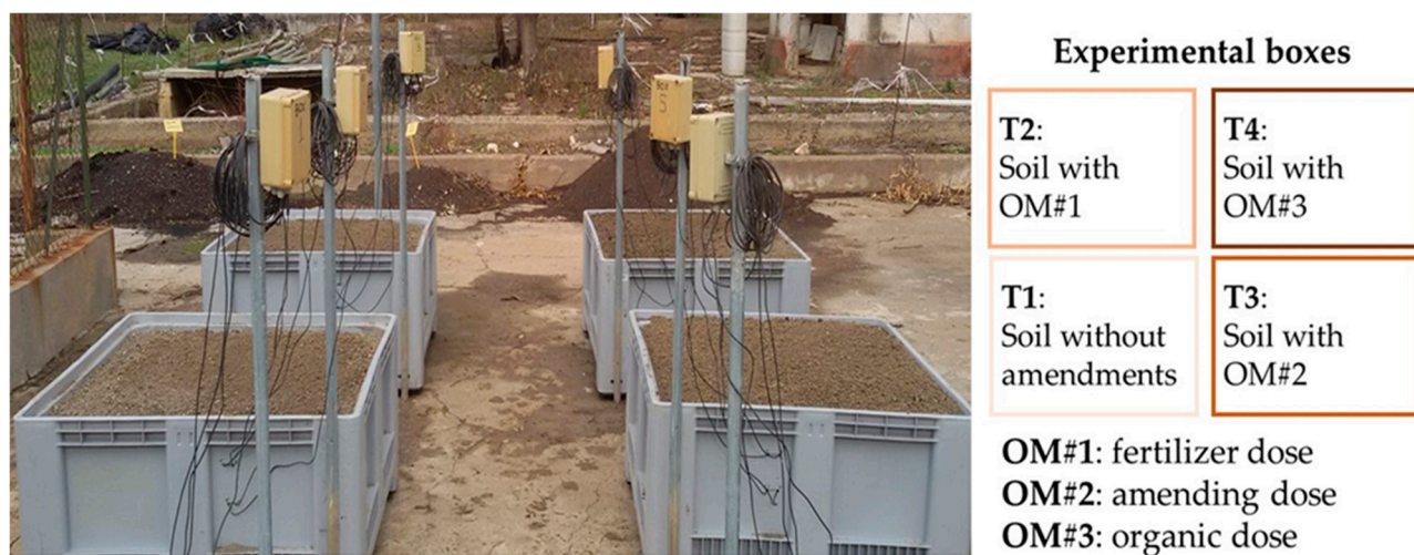
Figure S1. View of experimental boxes with indication of the four treatments (T) considered. Note that boxes arrangement in figure corresponds to schematization on the side.