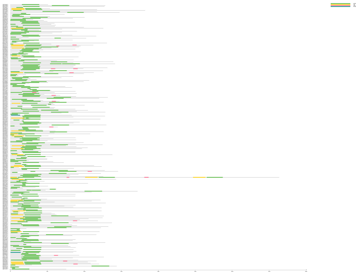
Figure S1. The conserved domains of SmNBSs .