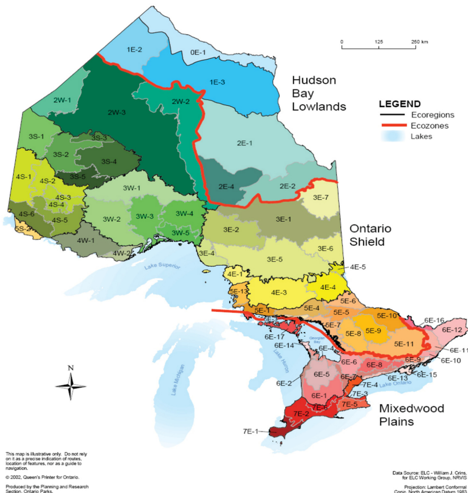
Figure A1. The ecozones, ecoregions and ecodistricts of Ontario [3].