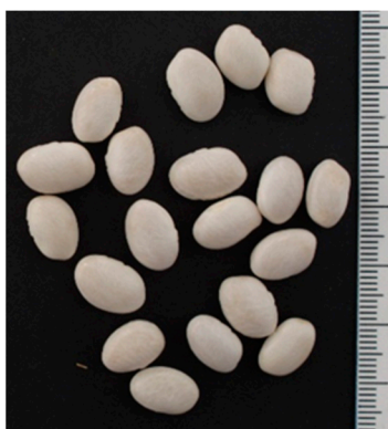
Figure 1. Typical shape of the seeds of the Castellfollit landrace; seeds from the ends of the pods tend to be more rounded. The scale is in cm.

Castellfollit del Boix (hereafter, simplified to Castellfollit) is a landrace of the common bean ( Phaseolus vulgaris L.) that is adapted to cultivation without irrigation in the conditions of the Castellfollit del Boix municipality in central Catalonia (northeast of the Iberian Peninsula), where its cultivation is centered. Being of Mesoamerican origin [7], this bean has been grown in the locality since the eighteenth century [8]. White seeds, whose shape is between rectangular and oval, characterize Castellfollit landrace (Figure 1). The plant has an indeterminate growth pattern type III [9], but it is cultivated without supports because the plants do not grow very high without irrigation. This variety's main appeal lies in its sensory traits (hardly perceptible seed coat, high creaminess, and delicate but intense dry bean flavor) and culinary qualities (large proportion of whole seeds after cooking).