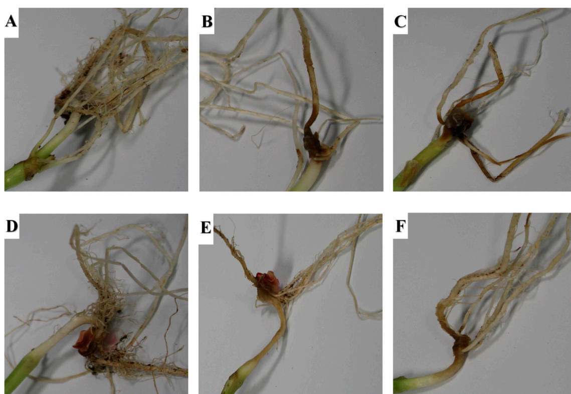
Figure 2. Pictorial view of root inoculated with (A,D) no pathogen, (B,E) F. subglutinans , and (C,F) F. temperatum (top, A–C = Miheung-chal, bottom, D–F = De Hack-Chal).

1 Percent severity index assessed three weeks after soil inoculation. Mean values having the same letter (s) in each a column are not statistically different ( p \leq 0.05 ).