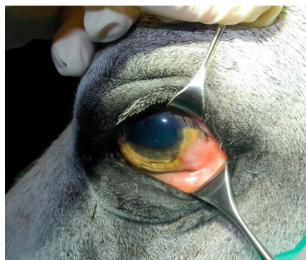
Figure 3. Clinical photograph of a Connemara Pony (Case 3) depicting the pink, raised mass on the left temporal limbus and cornea.

A seventeen-year-old Connemara Pony gelding was presented to the Bailly Vétérinaires Clinique du Lys for evaluation of a mass affecting the left eye. Ophthalmic examination revealed a pink, raised mass affecting the temporal limbus and cornea OS (Figure 3). The mass was excised completely and sent for histopathological examination. Histopathology found the mass to be composed of atypical keratinized epithelial cells that were not uniform (differed in shape from round to polygonal), and were arranged in clusters or individually. Criteria for malignancy were considered to be obvious and included a high nucleocytoplasmic ratio, large nuclei with granular chromatin, prominent and visible nucleoli, moderate anisocytosis, and anisokaryosis. The pathologist's conclusion was epithelial carcinoma (SCC).