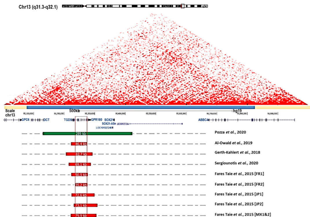
Figure 3. Summary of 13q32.1 structural variations associated with congenital microcoria. The two-dimensional heat map representing normalized Hi-C sequencing visualization in HMEC with the 3D Genome Browser is shown [72]. The topologically associating domain (TAD) encompassing the MCOR region and spanning 600 kb is indicated with a light blue bar (chr13:95,075,000–95,825,000, Hg19 and 5 kb resolution). Gene organization at chromosome 13q32.1, and position and size of structural variations (deletions in red; duplication in green) reported in individuals suffering from congenital microcoria [7,31,32,67]. The critical deletion (shown in red frame) responsible for MCOR spans 31.8 kb (hg19, chr13: 95,241,606–95,273,292). The reciprocal duplication encompasses 7 genes: DCT , TGDS , GPR180 , LOC101927248 , SOX21 , SOX21-AS , and LOC101927284 [12].

children. All were described as having normal chamber angle and early onset myopia [32] or minimal hyperopic astigmatism [67]. The mother in the Saudi family reportedly suffered bilateral senile cataract [67]. All the deletions except the one identified in Mexican families differ from each other, which suggests independent events [7]. Extensive bioinformatic analysis of deletion breakpoints and surrounding genomic architecture has identified a duplicated sequence prone to recurrent nonallelic homologous recombination in one case. The others likely involve nonrecurrent microhomology-mediated rearrangement [7]. Analysis of the positions of the deletions, which range in size from 35 kb to 85 kb, places the critical congenital microcoria-causing deletion in a 31.8 kb interval (Figure 3). Although variable in size, the deletions encompassed or interrupted the tail-to-tail genes TGDS and GPR180 .