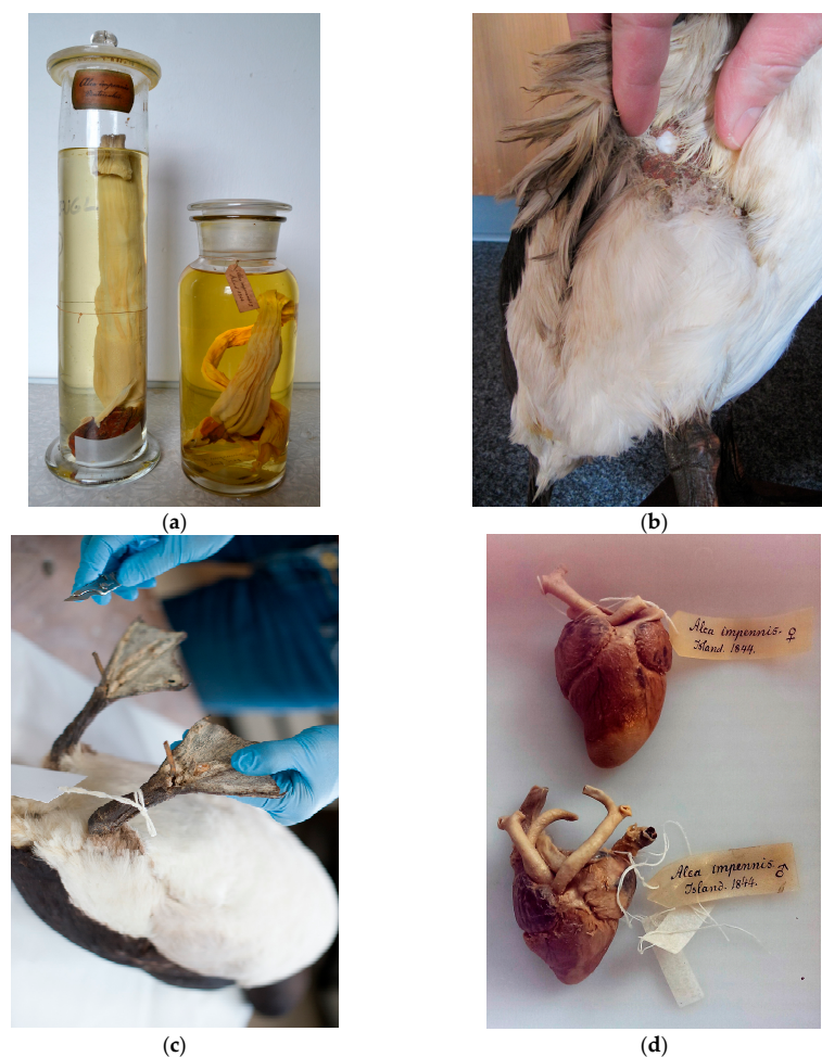
Figure 3. (a) Jars containing the oesophagus from the last two individuals killed on Eldey Island. The oesophagus from the larger jar represents that of the individual labelled male (NHMD153069) (MK131). The smaller jar contains the oesophagus from the female bird (NHMD153070) (MK132). (b) Sampling of The Oldenburg Auk (AVE 8086) (MK133) to remove a section of body tissue for DNA extraction. (c) Sampling the toe pad of The Bremen Auk (RKNr. 2392) (MK134) to remove tissue sample. (d) The hearts from the last two documented individuals. The heart from the female individual has been sampled for this study (top) (NHMD153070) (LastGA2_Heart).

Genomic DNA was extracted from the oesophagus (Figure 3a), skin (Figure 3b), toepad tissue (Figure 3c), and feathers using a modified version of Dabney et al. [14] in which the initial digestion was carried out following the protocol by Gilbert et al. [15]. This digestion buffer is better suited to extraction from these tissues types than the Dabney et al. [14] digestion buffer, which was optimised for DNA extraction from bone. Subsequent DNA purification and elution was conducted following the approach described by Dabney et al. [14]. Genomic DNA was extracted from the heart tissue (Figure 3d) using the protocol by Campos et al. [16].