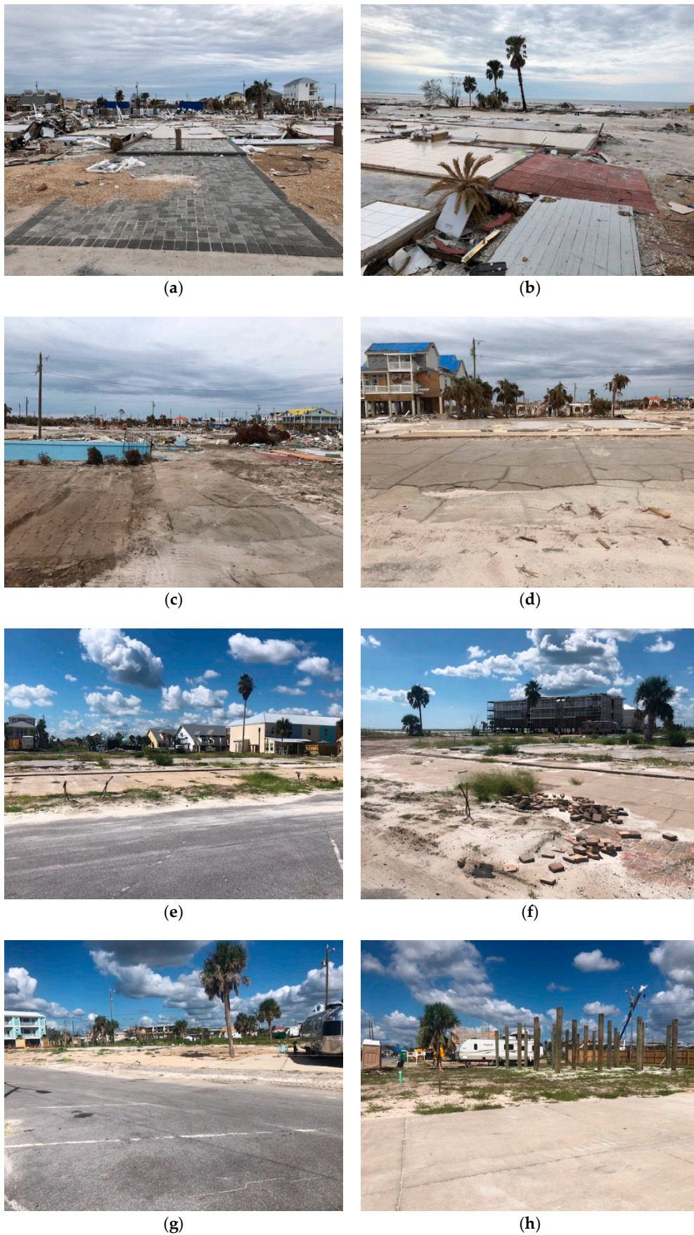
Figure 2. Mexico Beach storm surge damage zone in December 2018 (a–d). The same stretch of coastline in September 2019 (e–h). In September 2019, property had been mostly cleared of debris, and some owners were staying in campers (g,h) as they rebuilt.