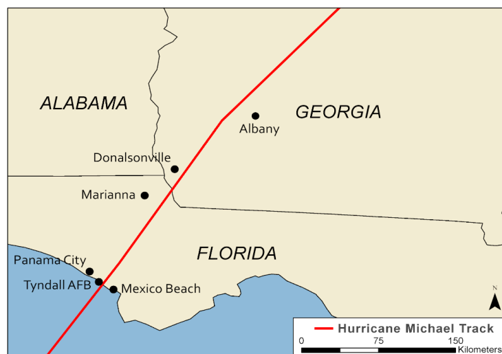
Figure 1. Hurricane Michael track with city names mentioned.

techniques and information sources, Hurricane Michael was officially recognized as a category 5 hurricane on the SSHWS post-season. It is the only category 5 hurricane known to have ever made landfall in the Florida Panhandle. It was categorized as an upper-end category 4 at landfall on 10 October 2018. Its landfalling pressure of 919 mb ranks as the third lowest ever in the USA behind the Labor Day Florida Keys hurricane of 1935 and Hurricane Camille in 1969. The estimated winds of 140 knots, 161 mph, 72 \text{ m}\cdot\text{s}^{-1} at landfall existed over only a small portion of the coastline; however, Michael maintained its powerful winds farther inland than any previous category 4 or 5 storm to make landfall on the northern coast of the Gulf of Mexico. Wind gusts of 46 \text{ m}\cdot\text{s}^{-1} were recorded at Marianna, FL, slightly west of the decaying eyewall and 51 \text{ m}\cdot\text{s}^{-1} at Donalsonville, GA, closer to the center of the track (Figure 1). When the center of Michael passed just east of Marianna, it was 90 km inland from the landfall point at Tyndall Air Force Base, and, when it tracked near Donalsonville, it was 130 km inland. Hurricane force gusts were recorded as far inland as Albany, GA, at 220 km from the landfall point. These inland wind speeds in this region have only been exceeded by a few strong Enhanced Fujita (EF) 2 and EF 3 tornadoes that have occasionally struck much smaller areas of land.