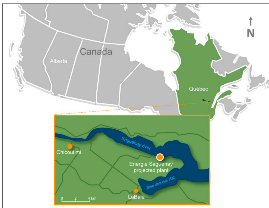
Figure 1. Location of the proposed site for the natural gas liquefaction complex of the project Énergie Saguenay, GNL Québec (Saguenay, Quebec, Canada).

In Quebec, the Cap-and-Trade System (Système québécois de plafonnement et d'échange de droits d'émission; SPEDE), a compliance carbon market linked in 2014 to the Californian system within the Western Climate Initiative (WCI) framework, mandates that industrial emitters responsible for >25,000 \text{ t CO}_2\text{-eq y}^{-1} offset all emissions above their allocated GHG emission units [31,32]. In accordance with Quebec's SPEDE's regulations, only direct GHG emissions—Scope 1 of the Énergie Saguenay project, i.e., the ones directly linked to the liquefaction facility activities per se are to be considered [32,33]. Emissions relating to natural gas extraction and transport are to be taken stock of and reported to the pertinent provincial ministry by the extracting company and pipeline owners, respectively [32,33]. Hydroelectricity provided to the plant by Hydro-Québec (crown corporation) falls into their own Scope 1 emission declaration to the SPEDE and are excluded from the Énergie Saguenay project GHG balance sheet to avoid double-entry [32,33]. Therefore, the organizational boundaries are circumscribed to the liquefaction complex and the reductions and/or offsets must match the pertaining future emissions, estimated in the LCA to be 421,000 \text{ t CO}_2\text{-eq y}^{-1} ( 420,000 \text{ t CO}_2 \text{ y}^{-1} and 1000 \text{ t CO}_2\text{-eq y}^{-1} due to methane— \text{CH}_4 ) [27,32].