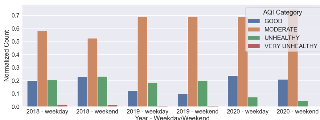
Figure 3. The descriptive statistics of the overall AQI on weekdays versus weekends in 2018, 2019, and 2020.

indicated that the difference in the level of anthropogenic activities in Jakarta during weekdays and weekends was negligible and that it did not affect the distribution of the overall AQI categories in the same year. However, the distribution between years was noticeably different. The air quality in 2019 was in general worse than in 2018 with the increase in moderate and unhealthy days. However, the air quality in 2020 was observed to be improved with an increase in days with good and moderate AQI and a decrease in unhealthy AQI days.