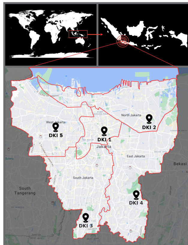
Figure 2. Air Quality Measurement Locations in Jakarta.