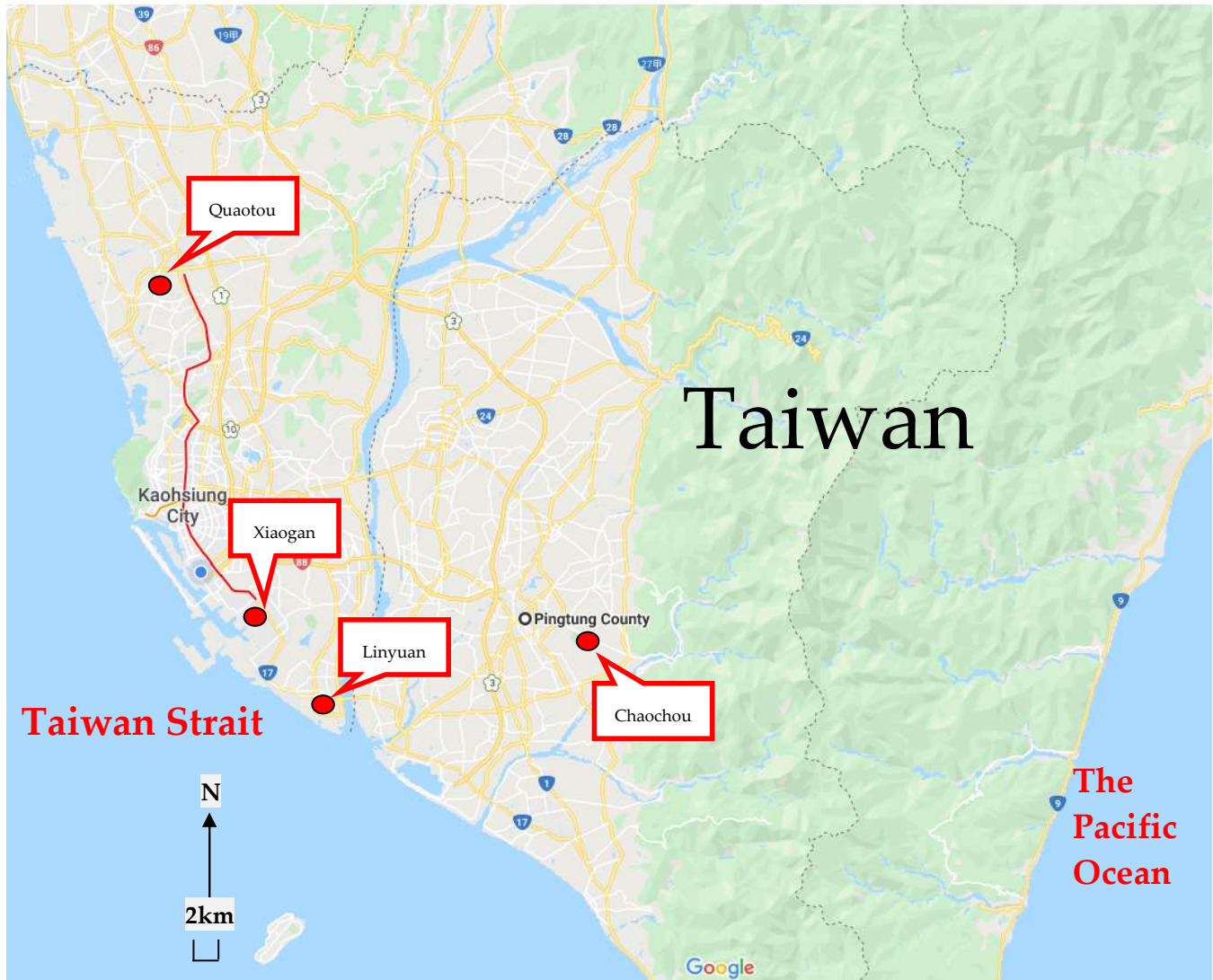
Figure 1. Photochemical monitoring stations in the Kaohsiung-Pingtung area of Taiwan.

where f_1, \dots, f_q are common factors contained in each variable x_i , \epsilon_i is special factor contained only in the i th variable ( x_i ), and \ell_{ij} is the loading of i th factor to the j th common factor ( f_j ).