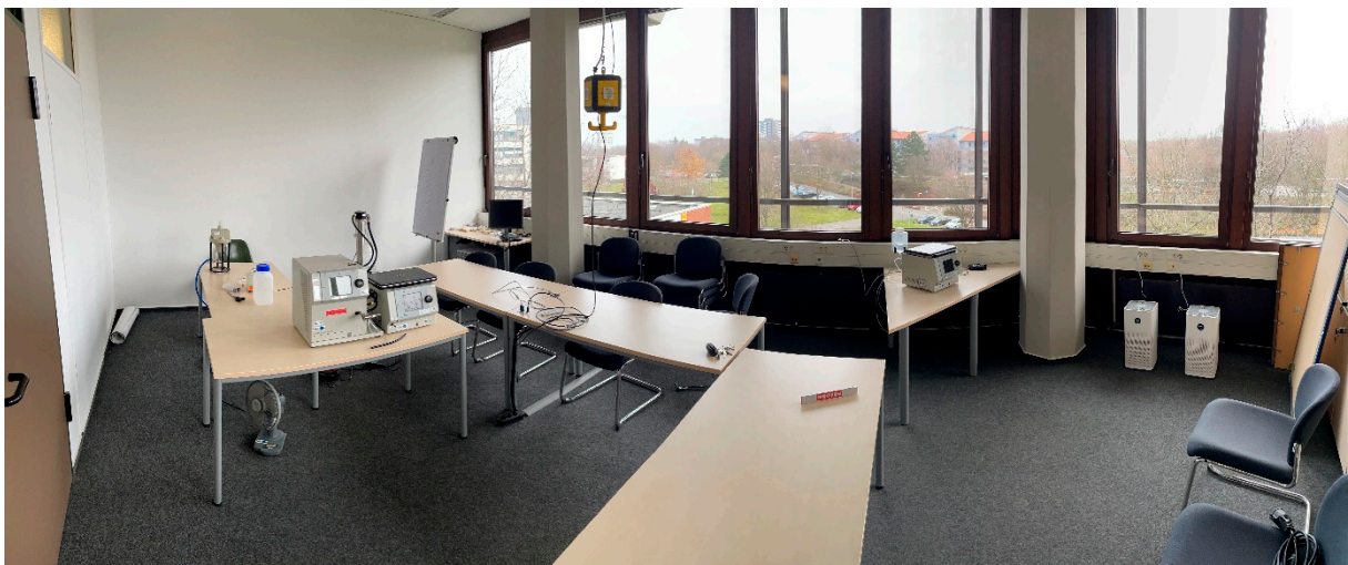
Figure S3: photo of the seminar room setup