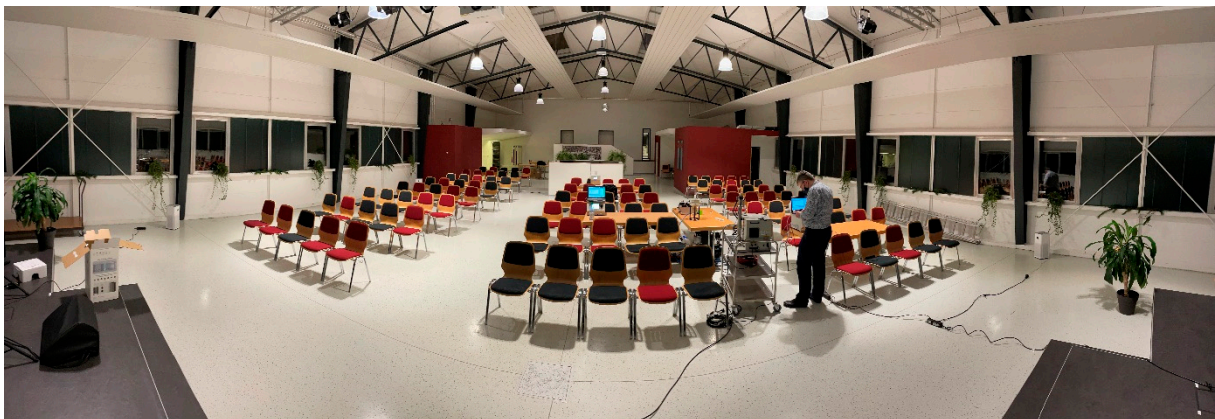
Figure S2: photo of the community hall setup