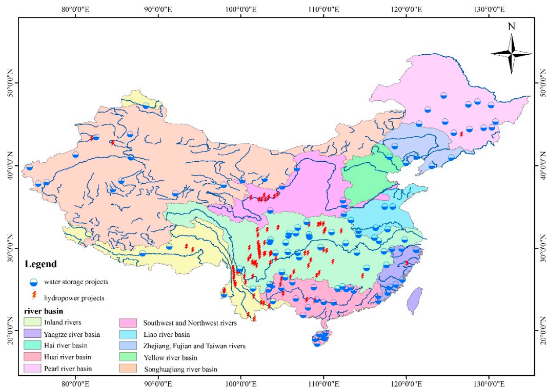
Figure 1. Locations of the water storage and hydropower projects.

Due to the multiple types of methods, this paper reviews the methods used in the projects that were implemented after 2006 which caused flow reduction, and determines the current situation and problems of various methods in China.