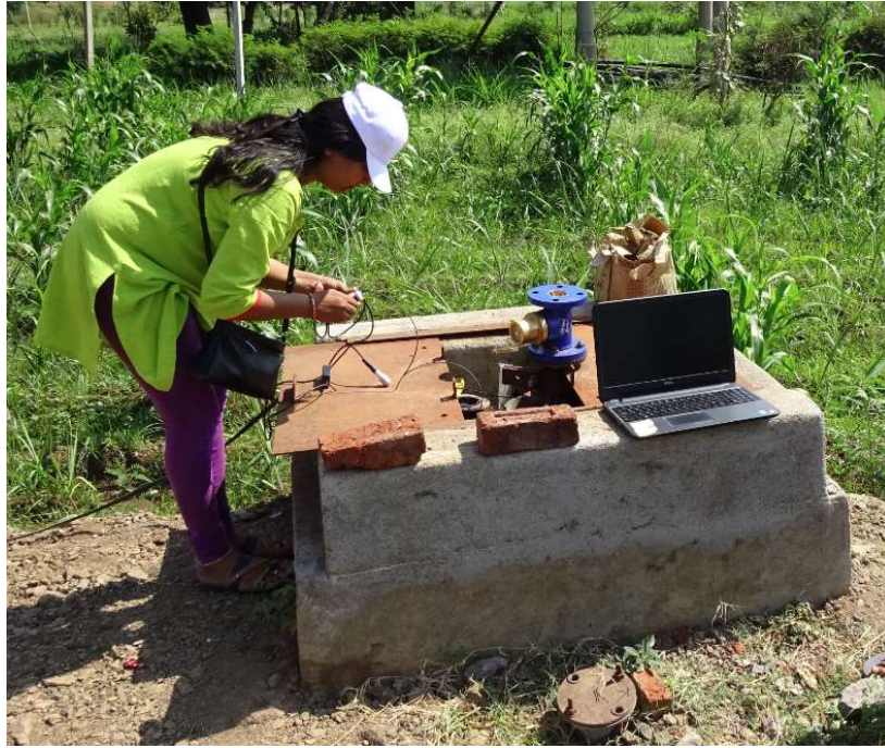
Figure S1. RBF well in Village 3 during logger data retrieval by co-author Mrs. K. Patil.