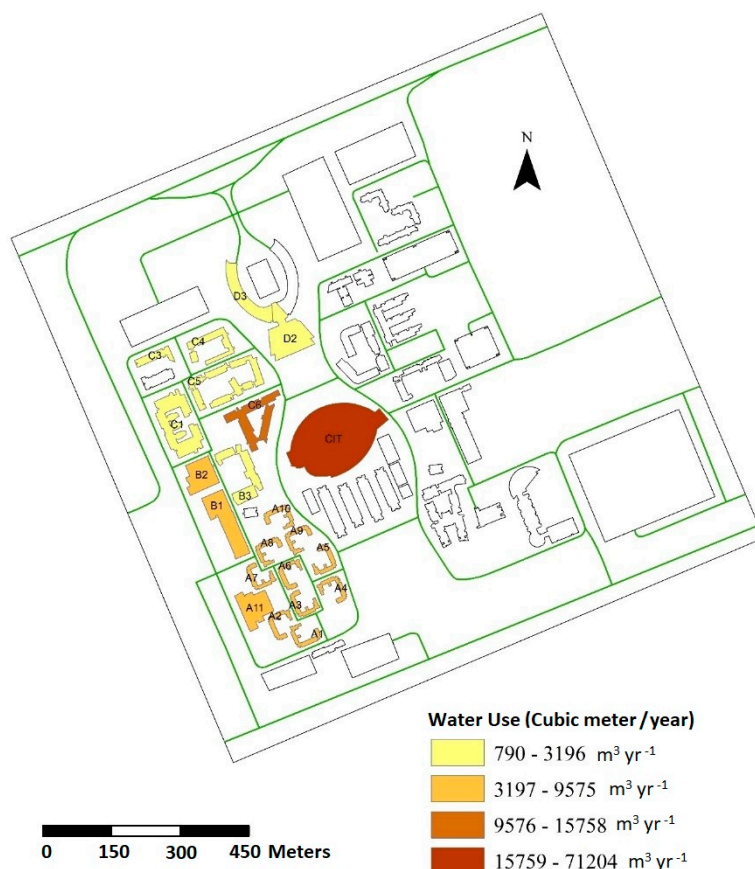
Figure 2. Schematic map of water use at the UAEU in 2017.