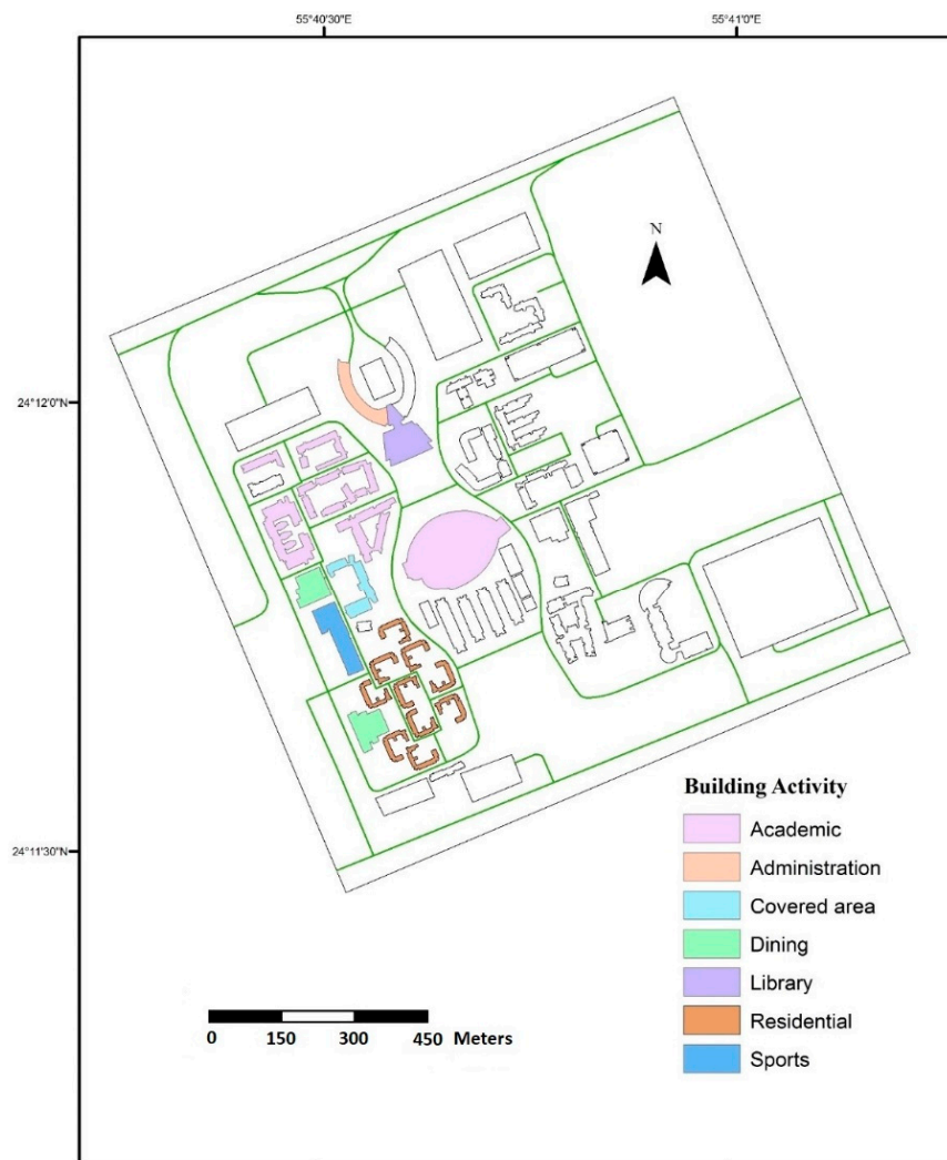
Figure 1. Geographic location and building activities at the United Arab Emirates University (UAEU).

the number of students in each hostel was the same (250). Therefore, the monthly water use data for 2016, 2017, and 2018 were summarized using the totals and averages over space (cross-sectional) and time (longitudinal). The percentage of water use in each building was employed for a comparative study of different sites (benchmarking). The relationship between water use and number of students in academic buildings was modeled using least-squares regression. Despite the considerable size of the UAEU campus, the number of samples for individual activities was often too small to conduct comprehensive statistical analysis of the data.