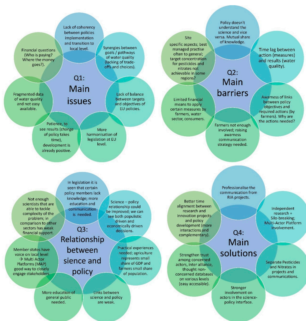
Figure 2. Key points for Questions 1, 2, 3 and 4 on the role of science in EU policy making and implementation related to drinking water resource protection against diffuse pollution of nitrates and pesticides from agriculture in the EU.

The issue of nitrate pollution from overstocking was mentioned in the workshop, such as in regions in Germany, Flanders, the Netherlands, Brittany, and Catalonia. A significant part of the nitrate pollution comes from farms that do not have land and do not fall under the CAP. In these regions and in regions with intensively managed cropping systems, such as vegetables in Andalucía and the Netherlands, there is frequently an overuse of manure and mineral fertilizers leading to nitrate leaching into groundwater and surface water. Very few member states have set out a comprehensive approach to reducing nitrate leaching in order to meet the target goals of the WFD.