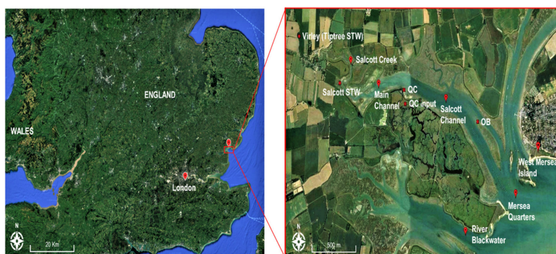
Figure 1. Map of the study site, Salcott Creek Channel, Essex, UK showing the location of the sampling sites.

reductions in the numbers of oysters in the estuary have raised concerns about the possible increased levels of water contamination. The identification of the main sources of faecal pollution contaminating the oysters will provide the basis for an effective management plan.