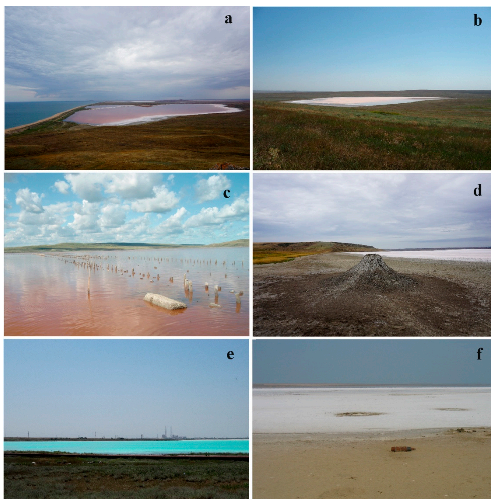
Figure 2. The Crimean studied lakes: (a) Lake Koyashskoe; (b) Lake Kirkoyashskoe; (c) Lake Chokrakskoe; (d) Mud volcano on the dried bottom of Lake Tobechikskoe; (e) Lake Krasnoe; (f) Lake Uzunlarskoe.

Crimea is the largest peninsula in the Black Sea (area of 27,000 km 2 ), and due to arid climate in the majority of its territory, there are more than 60 saline and hypersaline lakes and Bay Sivash, the world's largest hypersaline lagoon (Figures 1 and 2) [29–31].