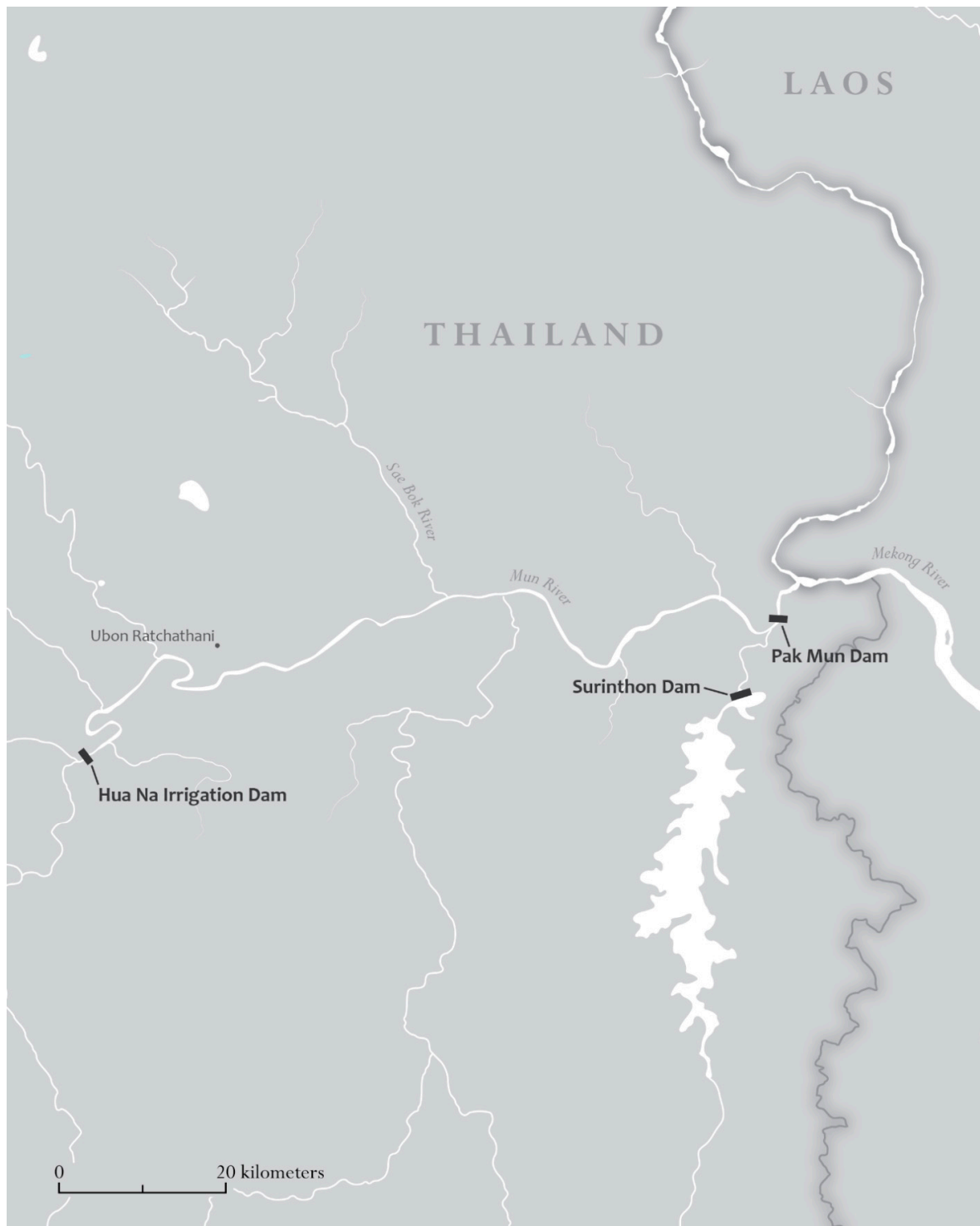
Figure 3. The Lower Mun River Basin, including the Pak Mun, Hua Na, and Surinthon dams, northeastern Thailand.

outside of the reservoir area also face problems of declining fish catches. The Pak Mun Dam is directly responsible for these declines because it blocks migrating fish from moving between the Mun and Mekong Rivers [10,71–78]. Even with a fish ladder that was added later to mitigate the loss of migratory fish, upstream fisheries have declined. Very few fish use the fish ladder, and the disruption of, and changes to, the river's hydrology has negatively affected the livelihoods of peoples in the entire basin [76–78].