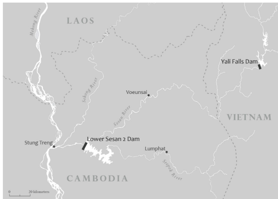
Figure 1. The Sesan River Basin, including the Yali Falls Dam and the Lower Sesan 2 Dam, northeastern Cambodia and the Central Highlands of Vietnam.