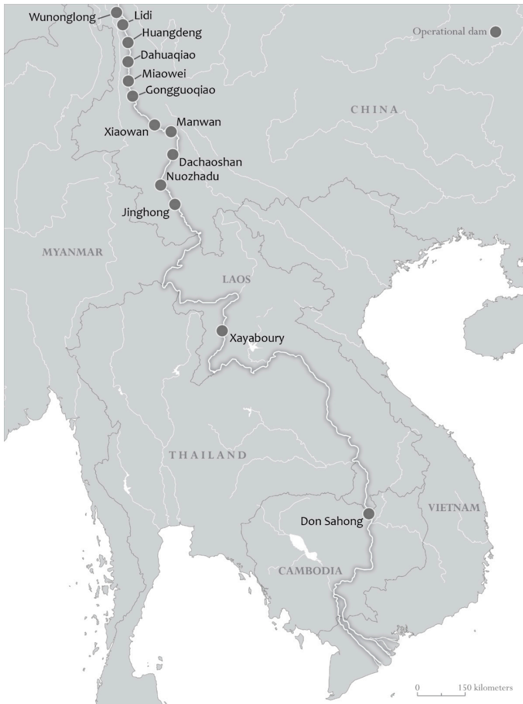
Figure 4. The Mekong River Basin, including hydropower dams built on the mainstream Mekong/Lancang River in China and Laos.

has a long history of non-cooperation in the Mekong Basin, at least when it comes to discussing its own plans for dam-building on the Mekong. Downstream impacts are rarely considered, and never sufficiently [84,85]. Within China itself, the lack of transparency and collaboration with local actors is also concerning [86].