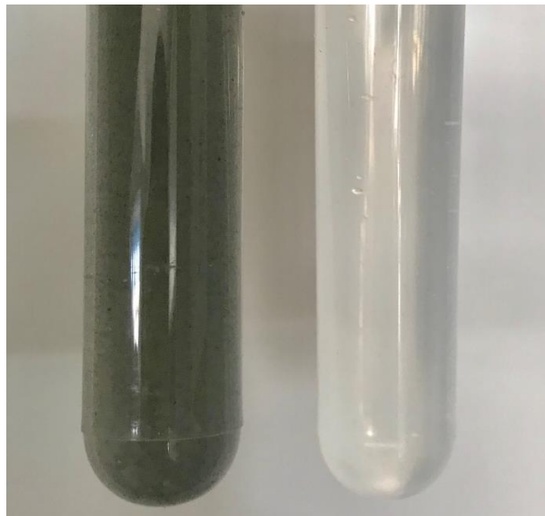
Figure S2. Digital pictures of the influent (left) and the effluent (right).