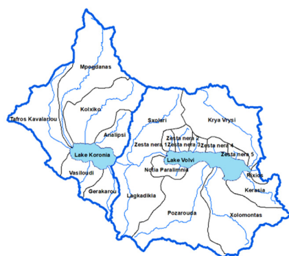
Figure 1. Map of the reference area provided by Malamatis D. in his PhD.

Mygdonia Basin is a protected wetland according to the Ramsar Convention, with a complex water system comprising Lake Koronia (western part of the basin, 1278 km 2 ), Lake Volvi (eastern part of the basin 783.48 km 2 ) and the Mygdonia groundwater aquifer (Figure 1). The Ramsar Convention encourages the designation of sites containing representative, rare or unique wetlands or wetlands that are important for conserving biological diversity. The Koronia and Volvi wetlands support endemic fish, nesting waterbirds and large numbers of wintering birds, including Anatidae (geese, ducks, swans, etc.). Several nationally rare or endangered aquatic plants also occur here [45].