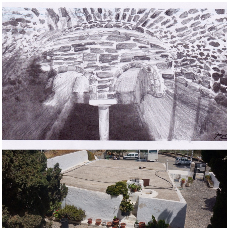
Figure 4. Interior (top) and well access (bottom) of the cistern at Panagia Episkopi. Illustration and photography by Jared Enriquez.

The third task involved the identification of water features and monuments on Santorini that could be mapped and signposted along a water hiking trail accessible to both local residents and visiting tourists. In the spring of 2017, two members of the team returned to the island to document