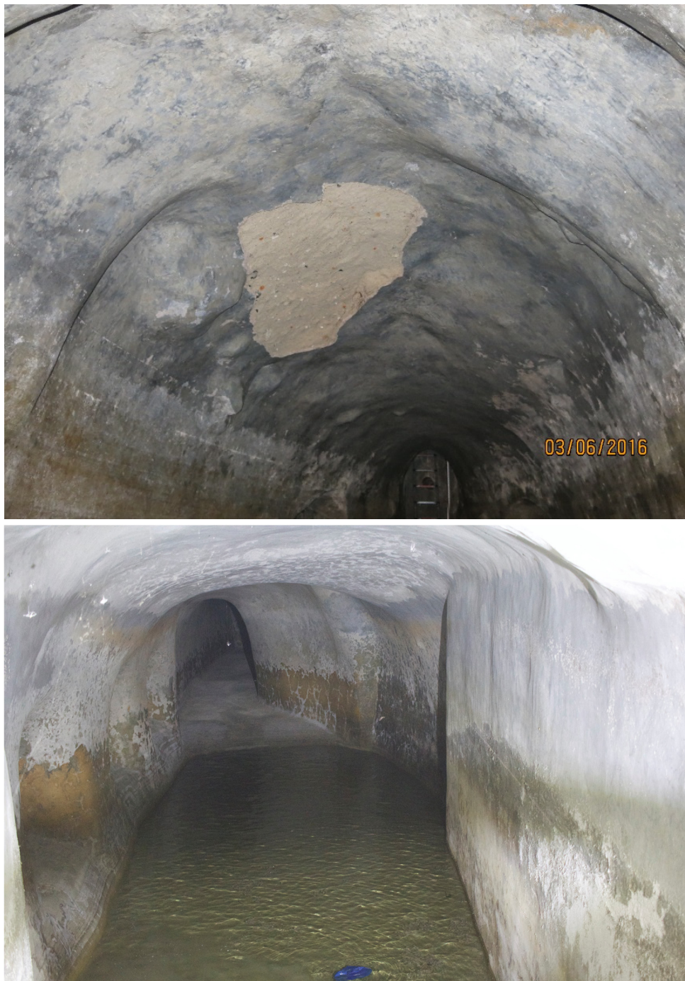
Figure 6. Damaged section of liner inside the water closet cistern in Pyrgos ( top ). Structurally sound conditions at the Exo Gonia cistern near Art Space ( bottom ).