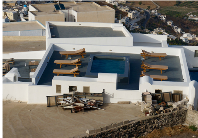
Figure 1. Example of rooftop water features, spaces in previous centuries that would serve as catchment areas for collecting rainwater into the household cistern.

Instead of paying attention to the ancient water supply system that made the settlement of Santorini possible, visitors to the island are treated to swimming pools, jacuzzis, and an impression of abundant water (see Figure 1). They are not encouraged to conserve water, and many remain unaware of the ingenious technologies developed to manage water on the island from antiquity to the 20th century.