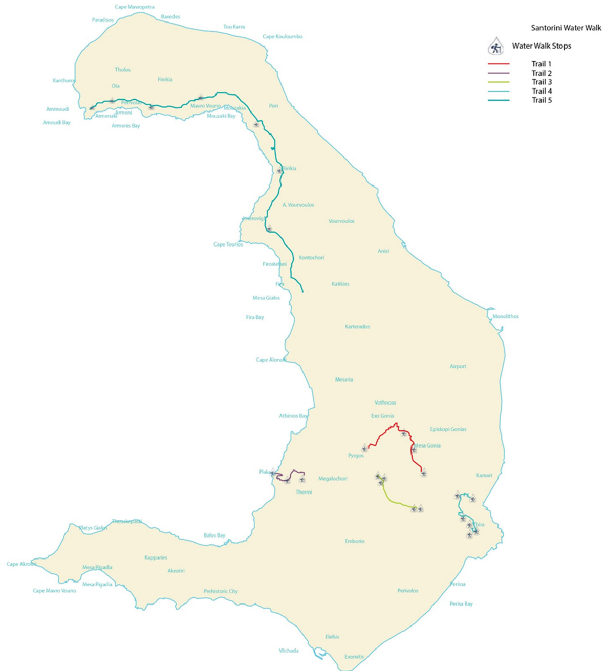
Figure 5. Map of proposed water walk stops and trails. Map prepared by Laura Kenny.

five water walks on a map with explanatory keys that tourists could navigate (see Figure 5 below). The community could develop additional trails and signage, contingent on community support for the development of the project.