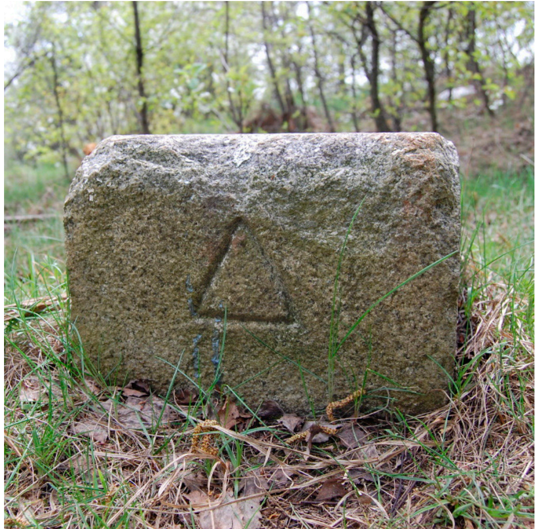
Figure 3. The astrogeodetic mark “Sucha Góra”.

above the excavation so that the floor was completely insulated from the iron pillar of the measuring instrument [30] (Figure 3).