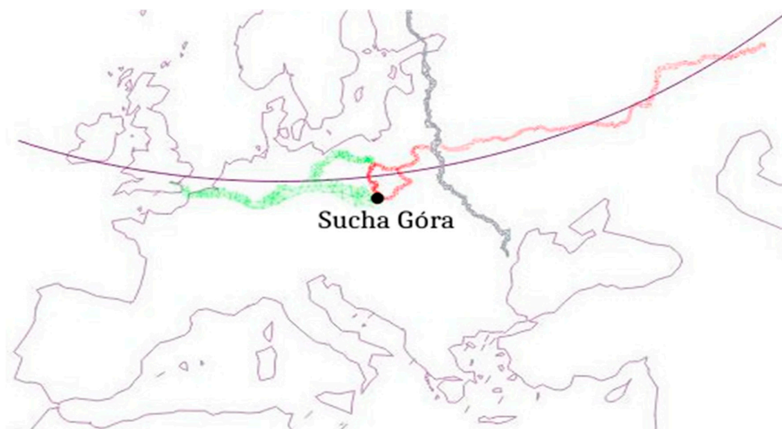
Figure 4. Schematic course of the triangulation network in Western (green lines) and Eastern (red lines) Europe. (Map made by us based on [27]).

In summing up his work, Struve pointed out that there was already a continuous European triangulation network between Hammerfest in the north, Cap Marco in the south, Valencia in the west and Astrakhan in the east [31]. This prompted Struve to undertake an ambitious project to measure the length of the arc of the 52^{\circ} N latitude parallel and its point of connection Trockenberg-Sucha Góra. This project significantly influenced another, equally important from the point of view of the history of geodesy projects measuring the European meridian [32], about which we will write later in the article. Figure 4 shows a schematic course of the triangulation network in Western and Eastern Europe related to the measurement of the 52^{\circ} north latitude arc and its connection point: Trockenberg i.e., Sucha Góra.