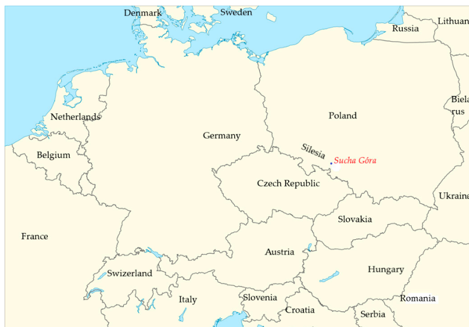
Figure 1. Sucha Góra in Europe (made by us, based on Central Europe Location Map Wikimedia Commons).

we tried to trace its relationship to the Austrian cadastre [9–12]. All sources, cartographic, text, and photo, are characterized in the section “Results”. We present the results of our field research in the following order: (a) the history of this point witnessed the development of triangulation and geodesy in Europe, while proving its uniqueness as a link between the three largest triangulation networks on this continent, (b) we show the role this site had in the triangulation-based measurements of the Earth.