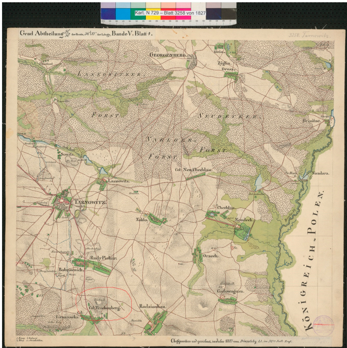
Figure 2. Urmesstischblatt map No. 3258 Tarnowitz, 1827; including (Trockenberg (Sucha Góra) is in red circle) [26].

in accordance with the cartographic guidelines contained in the aforementioned Müffling's instruction from 1821 [26], (Figure 2).