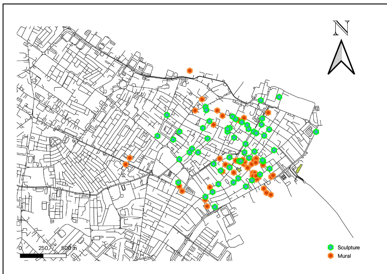
Figure 3. Locations of Sculptures and Murals in the George Town City.

This study collected 852 records of traded prewar shophouses in George Town, Penang, from 2009 to 2019 (10 years). These properties fall under the II category of heritage sites based on the UNESCO World Heritage Guidelines. The locations of street art (sculptures and murals) in George Town were plotted using QGIS, as shown in Figure 3. In addition, Figure 4 shows the number of sculptures and murals in the surrounding prewar listed buildings within 100 m, 500 m, and 1000 m radii. According to the Heritage Management Plan [39], there are only 4649 buildings in George Town in the core zone and buffer zone, with a size of 109.38 hectares and 150.04 hectares, respectively. As for the category of listed buildings II, it includes 3572 units. In addition, there are 119 pieces of street art, either in the form of murals or sculptures, distributed in George Town, as listed in Table 1.