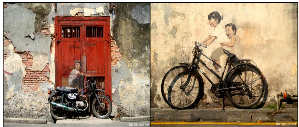
Figure 1. Murals in George Town.

In 2009, the Penang State Government initiated the “Marking George Town” project to make George Town a UNESCO World Heritage Site. This project aims to tell the history of the streets and the stories of the communities of George Town through the steel bar sculptures with a local voice. There were 52 steel rod sculptures deciphered and placed in each street to explain the history of past events in George Town. In addition, the mural is part of the street art projects in George Town. It was launched in 2012 under the theme “Mirrors George Town”. The six murals were designed by the famous artist Ernest Zacharevic. The murals not only have a high artistic value, but also convey some messages about the phenomenon or culture of a city. Before 2012, there were hardly any murals or sculptures and now they are a feature of George Town [19]. Some examples of steel bar sculptures and murals are shown in Figures 1 and 2.