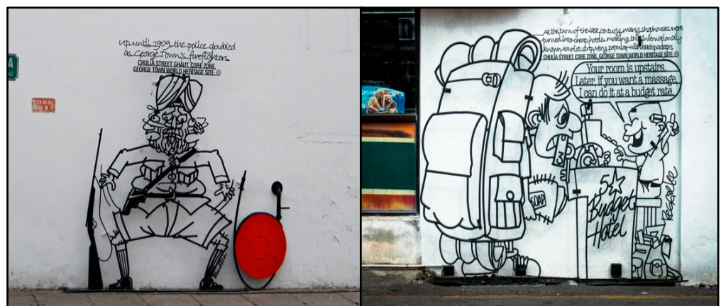
Figure 2. Steel Rod Sculptures in George Town. Source: [21].

As Liang [1] claims, street art is part of George Town's cultural landmark, and many tourists are interested in posing with the murals and uploading their photos to social media to prove that they were there. Tourists have also responded well to the street art, which adds appropriate meaning and local cultural flair to the area. However, according to Sadatiseyedmahalleh et al. [22], street art made of steel bars (sculptures) is far more practical compared to murals when it comes to maintaining its quality in the long run. The quality of murals deteriorates over time because they are exposed to a large volume of