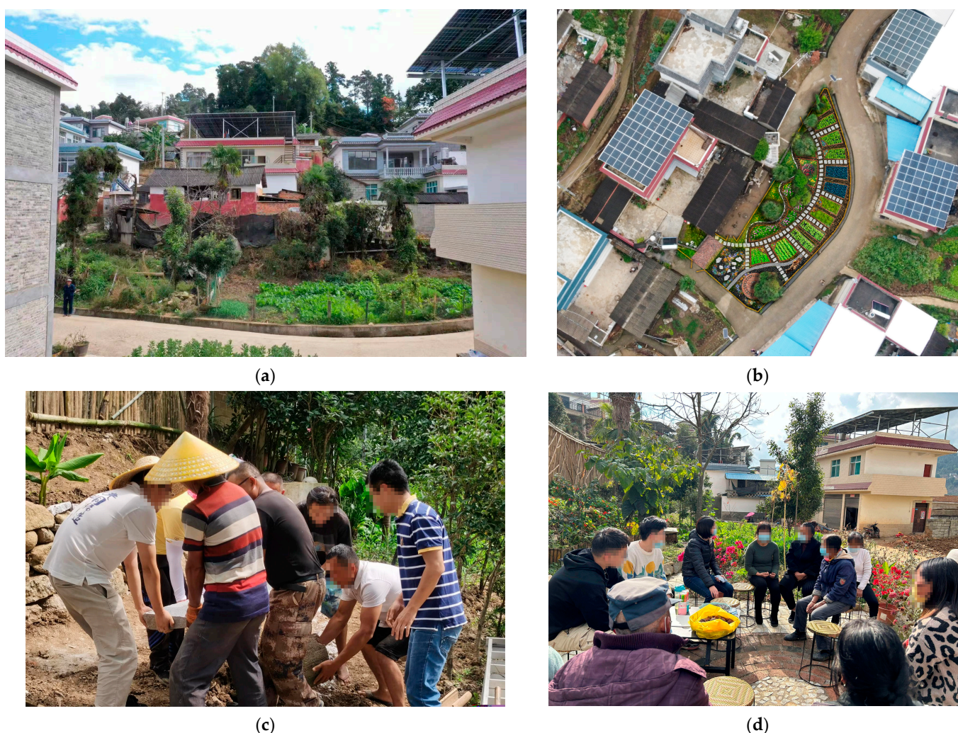
Figure 4. The improvement of Yang's small vegetable garden. (a) Before the improvement; (b) the design rendering; (c) the construction process; (d) after the improvement. Source: the authors, taken in August 2022–December 2022.

This upgrade was strongly supported by the village committee and surrounding villagers, and all people jointly participated in the construction of stone handling, sawing bamboo, and bamboo piling. In this process, villagers taught each other their own knowledge and worked together to build a beautiful home (Figure 4). The upgrade of the small vegetable garden took 10 days to complete, and the surrounding resources were mobilized as much as possible, which greatly reduced the upgrade cost (more than 200 flat vegetable gardens cost less than 5000 yuan).