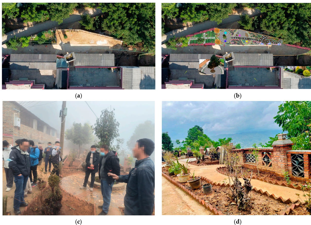
Figure 5. The improvement of Mei’s small vegetable garden. (a) Before the improvement; (b) the design rendering; (c) the visit of planners; (d) after the improvement.

After the joint design was completed, Mei’s household drew on the experience of the first few households and independently allocated the surrounding people and material resources for upgrade. The planners continuously optimized the design through online communication during the construction process (Figure 5). Compared with the previous upgrade, the subjectivity and ability of villagers had been greatly improved.