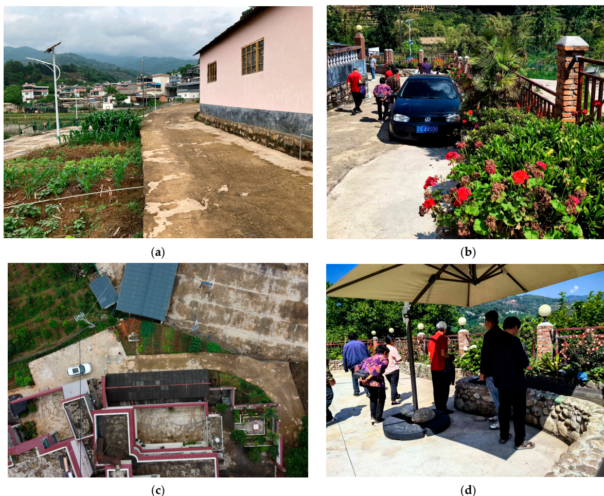
Figure 6. The improvement of Wang’s small vegetable garden. (a) Before aisle improvement; (b) after aisle improvement; (c) aerial view of the site before the improvement; (d) the villagers’ visit after improvement.

Through the strategic process of IMEE, the planners have successfully inspired many villagers to spontaneously join the improvement of the human settlement environment. Taking Wang’s home as an example, after seeing the transformation effect of Zhang and Yang’s small vegetable garden, he exchanged learning experiences with these two families and transformed an open space in front of his home into a small garden with a pool (Figure 6). This process was entirely completed by Wang himself by inviting craftsmen and surrounding neighbors, without the participation of planners. After construction, Wang took the initiative to apply for rewards to the village committee. In order to encourage more villagers to be like Wang, the village committee allocated reward funds to him according to the implementation method formulated previously (Figure 6).