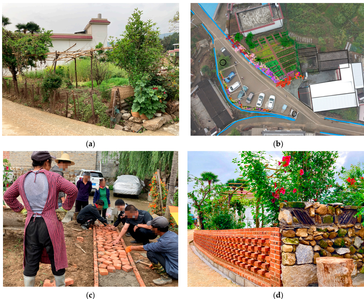
Figure 3. The improvement of Zhang’s small vegetable garden. (a) Before the improvement; (b) the design rendering; (c) the construction process; (d) after the improvement.