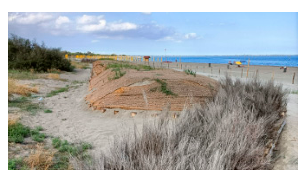
Figure 2. Artificial dune built on Bellocchio Beach.

The Panaro River is a tributary of the Po River and flows for the greatest part in the province of Modena in the Emilia-Romagna region (Figure 3), with a basin covering 1775 km<sup>2</sup>, 45% of which is in a mountain environment. The main hazard here is river flooding since the area is a natural floodplain. The basin is densely populated, with numerous industrial and agricultural activities, including livestock farming, resulting in a significant level of exposure. Vulnerability is further heightened by insufficient wetland management, inadequate flood protection for properties and structures, and diminished water retention capacity. Consequently, the region faces risks such as the potential loss of human life, infrastructure damage, property loss, and harm to agricultural crops and livestock. The chosen NBS is designed to alleviate the risk of flooding caused by soil erosion along the inner edge of the riverbank by planting deep-rooted shrub vegetation (twelve species of perennial cespitose and Leguminosae graminoid grasses) (Figure 4) to reinforce the embankment.