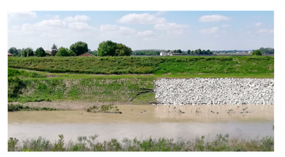
Figure 4. Deep-rooted plant planted on the Panaro River embankment (left side).