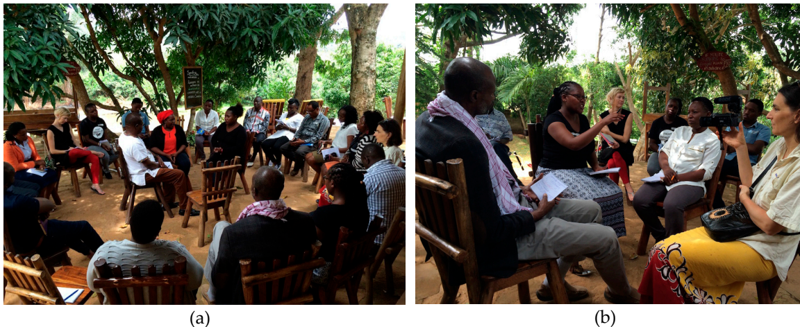
Figure 2. Fishbowl, Workshop Entebbe, Uganda, March 2019. (a) Arrangement of the outer and inner circle, the 'fishbowl', one chair remains empty; (b) filming discussions in the 'fishbowl'.

In the World Café, participants are divided into three tables. Each table is assigned a facilitator. The facilitator introduces the question and initiates the discussion. Everyone at the table exchanges ideas for about 20 min. Then, participants move on to the next table, except for the facilitator. He/she shares with the second group the ideas developed by the first group. Rather than starting from scratch, the second group thus builds on the ideas that were collected. After 20 min, the three groups move again to the next table. In the end, all participants go from table to table, listen to the facilitator's report and add information or ask questions [22].