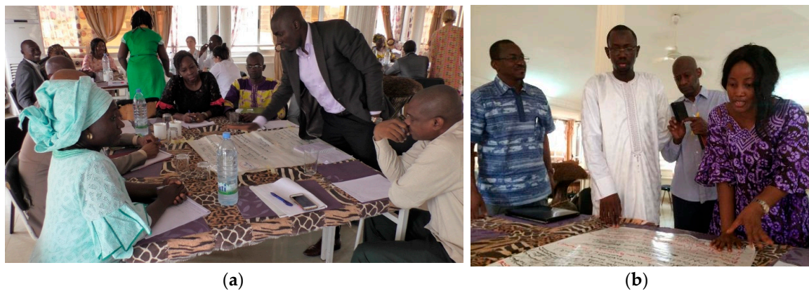
Figure 1. World Café, Workshop Bamako, Mali, June 2018. (a) Discussions at the three tables; (b) summarizing key points emerging from discussions for the next group of participants.