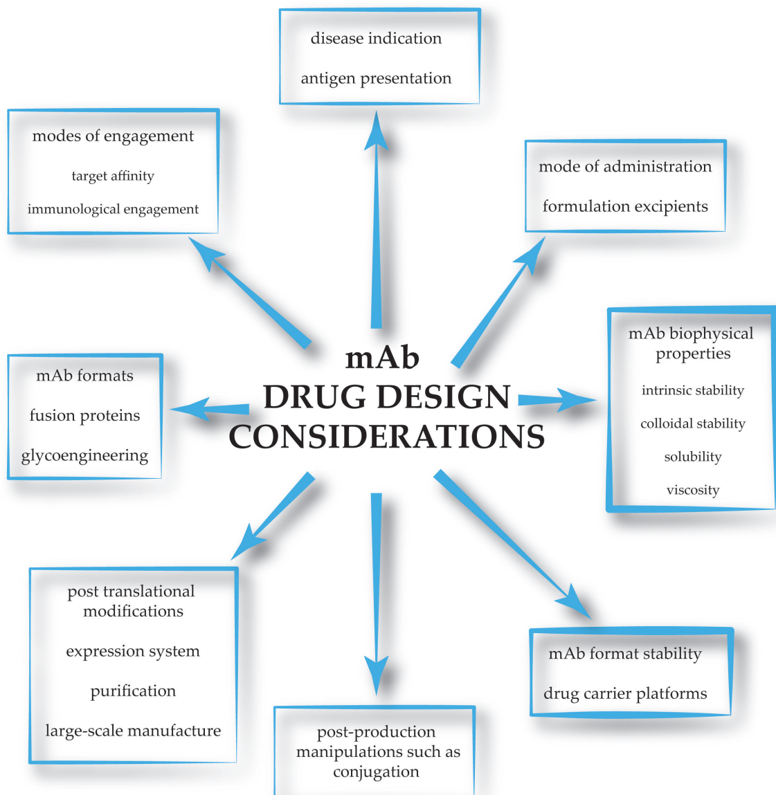
Figure 3. Schematic representation of the concept stages of mAb drug development in which considerations follow on from one process to the next in the design and manufacture of mAb-based therapeutics.