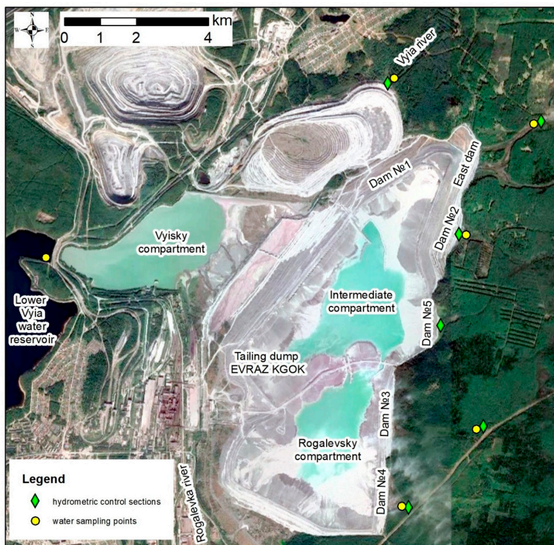
Figure 1. Tailings Dump Scheme.

formed by enclosing upstream dams and, partially, from the north-east, east and south-east, by hillsides. The capacity of the Vyisky compartment is formed by blocking the embankment dam of the Vyia River valley. Above the Vyia River bed, the compartment is limited by the lower water retaining dam of the Lower-Vyia Reservoir, located in a cascade towards the Vyisky compartment of recycled water. The Rogalevsky and Intermediate compartments are intended for tailings storage for beneficiation and clarification of the liquid phase of pulp. The Vyisky compartment is primarily used to receive clarified water from the Rogalevsky and Intermediate compartments of the settling ponds.