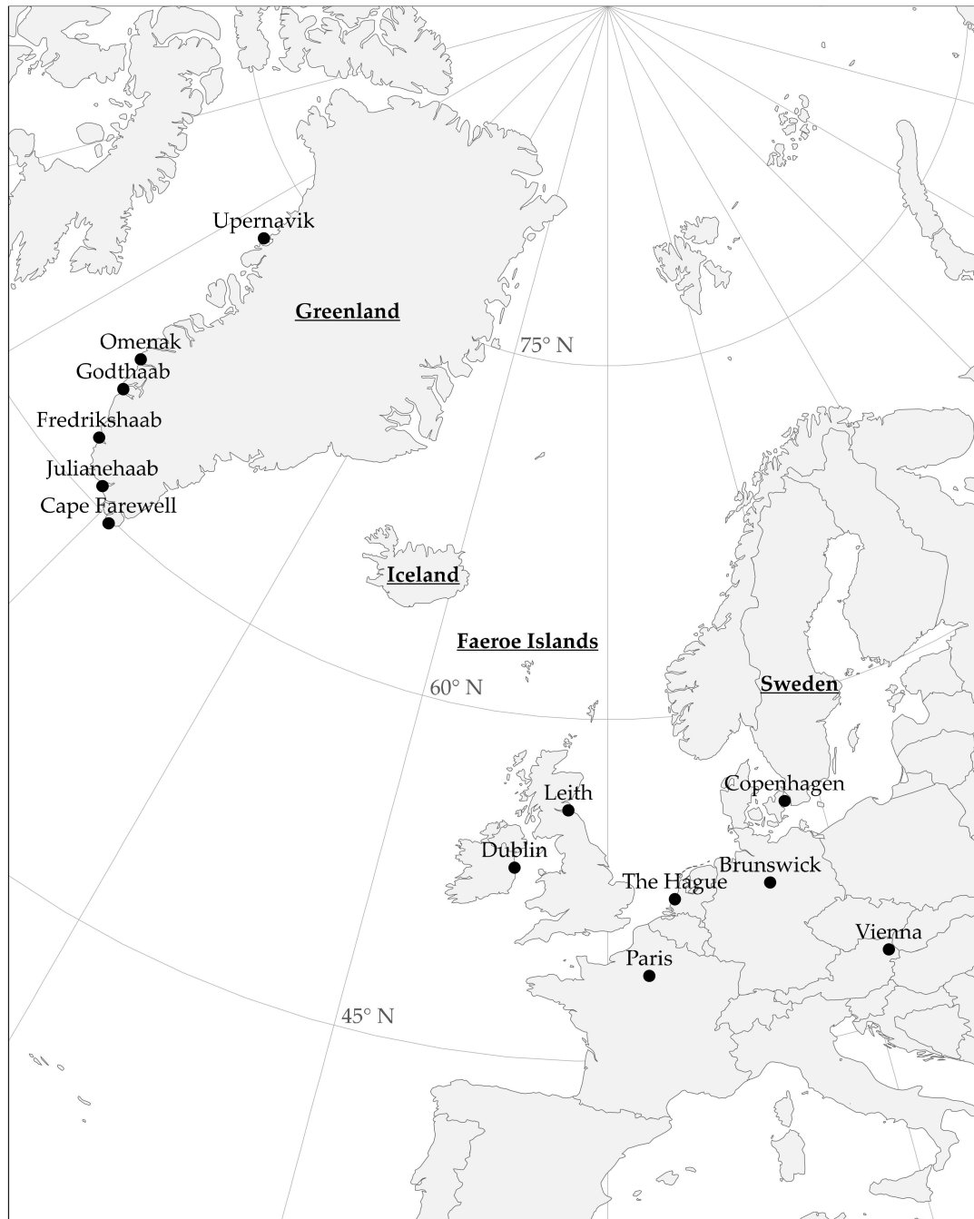
Figure 1. Map of Europe and Greenland with the names of important places pertaining to Prince Dimitri de Gallitzin and Karl Ludwig Giesecke. Original map credit: Chen-Pan Liao (CC BY-SA 4.0), the map has been adapted.

mention of a species from Greenland, neither is it mentioned in the new and revised version of the Traité [17]. With respect to Gallitzin's ambitiousness and the scope of his works, it indicates that the Greenlandic garnet variety was unheard of until at least 1796.