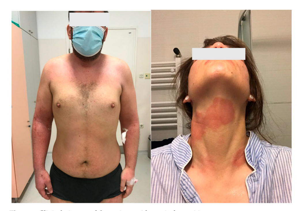
Figure 1. Clinical pictures of the patients with atopic dermatitis.

The prevalence of AD has doubled or tripled over the last 30 years in industrialized countries. It is estimated that 15% to 30% of children, and 2% to 10% of adults, are affected [4–7]. AD typically occurs in the first year of life (in about 60% of cases) but may appear at any age, and its complete remission has been observed in 70% of children before adolescence. Early onset of the disease, familial associations, and early allergen hypersensitivity are all risk factors for a prolonged disease course and persistence into adulthood [8,9].