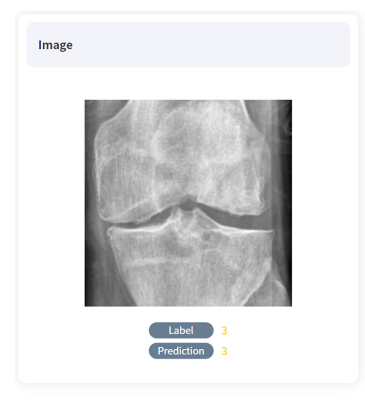
Figure 4. Cont.

Referring to the Grad-CAM image, we can see that overall, the deep learning model was able to locate and grade the knee joint arthritis despite undergoing unsupervised learning. Positive samples are shown in Figure 4.