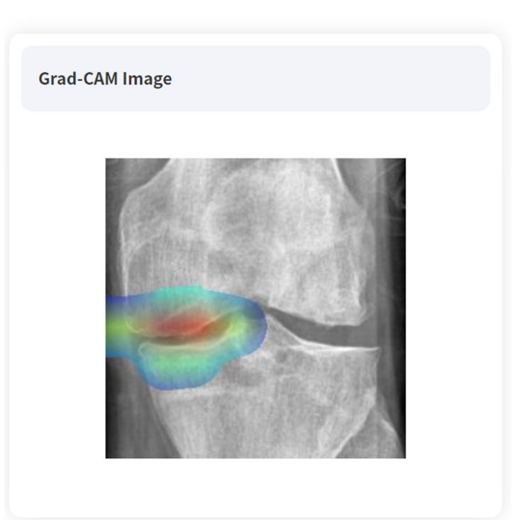
Figure 4. True-positive cases on AI algorithms with Grad-CAM images. The abnormal regions learned through the training can be identified by the observer through color mapping.