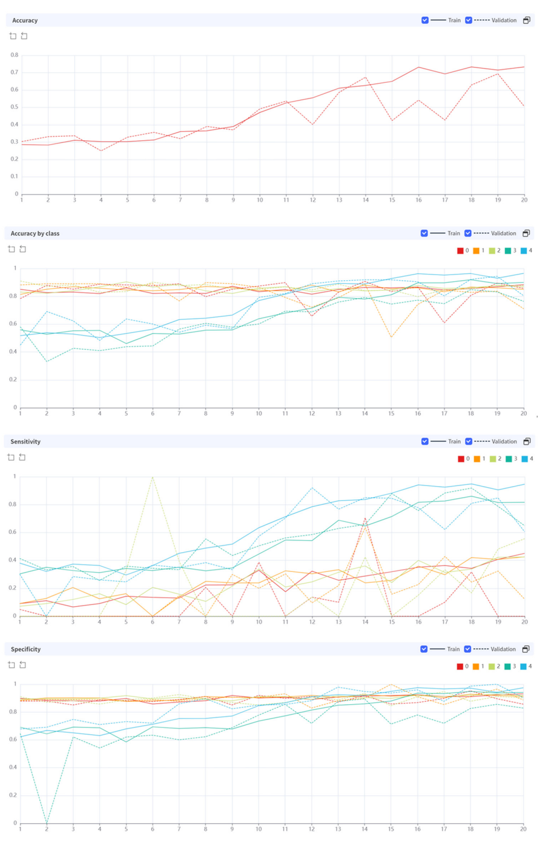
Figure 3. Diagnostic performance of AI algorithm during the training epoch.

Grade 4 osteoarthritis showed the highest overall performance in the training set, with an accuracy of 0.9652, sensitivity of 0.9462, and specificity of 0.9748. While there was some decrease in the validation set, performance remained strong with an accuracy of 0.8033, sensitivity of 0.6050, and specificity of 0.9029.