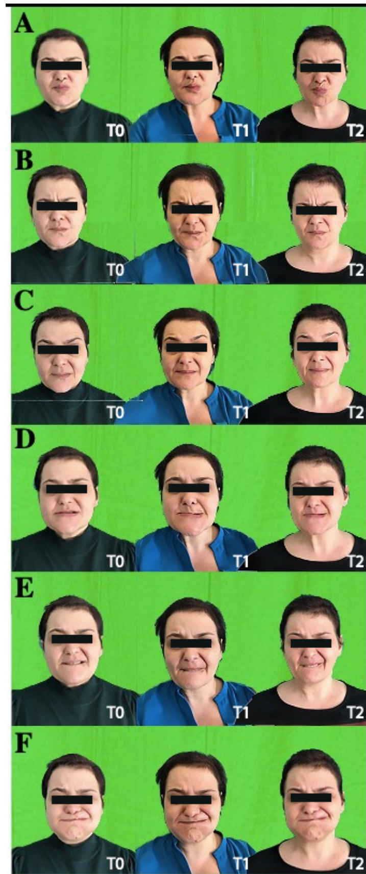
Figure 2. Movements executed by the patient during the examination to evaluate facial palsy at the different time-points from the left to the right: T0 (baseline), T1 (after 5 weeks), and T2 (at the end of treatment). (A): kiss with closed lips; (B): wrinkle the forehead; (C): elevate eyebrows; (D): bite the upper lips; (E): bite the lower lips; (F): puff up the cheeks.