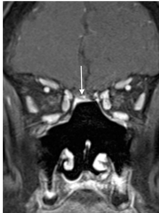
Figure 3. Magnetic resonance imaging for the surveillance of olfactory neuroblastoma. A postresection cavity is seen here without evidence of recurrent disease. The white arrow indicates persistent enhancement of a pedicled nasoseptal flap used in reconstruction.

overall and occurred most commonly within the first year after treatment. That being said, another 8.3% of local recurrences were detected over a decade following treatment [38]. In terms of regional recurrence, a Wolfe et al. study identified an 18% incidence of delayed neck disease diagnosed at a median of 59 months following treatment [24]. Lastly, the rates of delayed distant metastases have been reported, ranging from 8 to 25% [38]. As a result, surveillance through a combination of physical examination, nasal endoscopy, and imaging evaluating for local, regional, and distant disease are warranted for at least 10 years following treatment [1] (Figure 3).