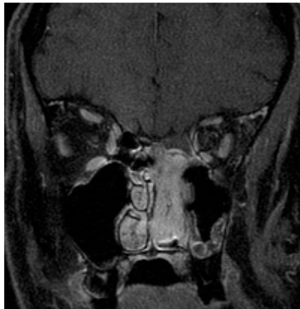
Figure 2. Magnetic resonance imaging for the diagnosis of olfactory neuroblastoma. A Kadish B tumor is seen here involving the nasal cavity and paranasal sinuses, not the orbits or intracranial cavity.

Critical features to examine during a review of preoperative sinonasal imaging regarding the extent of disease, including the presence of intracranial or orbital extension, as well as whether there is unilateral or bilateral disease within the nasal cavity. Fat-saturated MRI