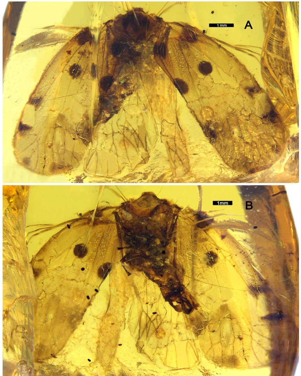
Figure 1. Maculixius jiewenae sp. nov., Holotype, MDHP11. (A) Habitus, dorsal view. (B) Habitus, ventral view.

Condition of head, prothorax, and forelegs unknown (specimen damaged) (Figure 1).